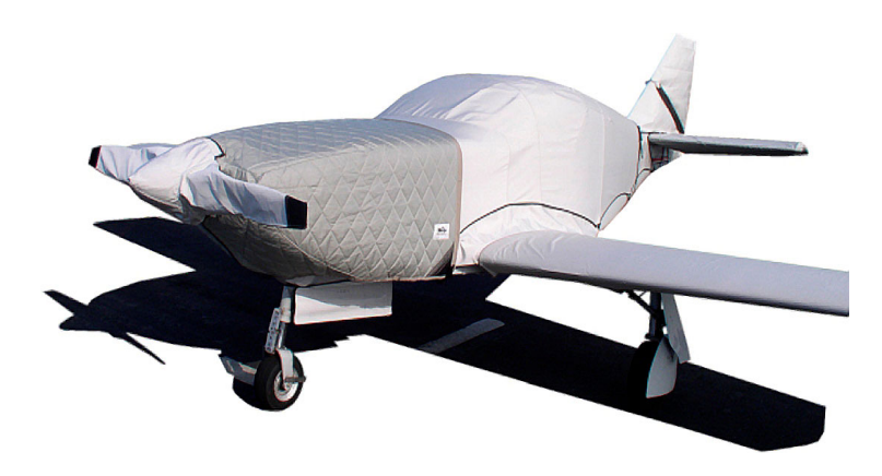
Glasair I Insulated Engine Cover, Prop Cover, Etc.

This cover type is made from Silver Acrylic Sunbrella canvas and is 100% lined with a soft and smooth microfiber. Bruce's Custom Covers developed this material combination especially for aircraft protection. The outer material is medium weight and treated for water resistance, UV resistance and anti-static buildup. The inner lining is a very soft and smooth microfiber to prevent scratching. The material is very reflective, and tests show that the cabin interior temperature can be reduced to near-ambient temperature on the hottest of days. It is water, ice and snow repellent, yet breathable to allow moisture to escape from between the cover and the aircraft surface.