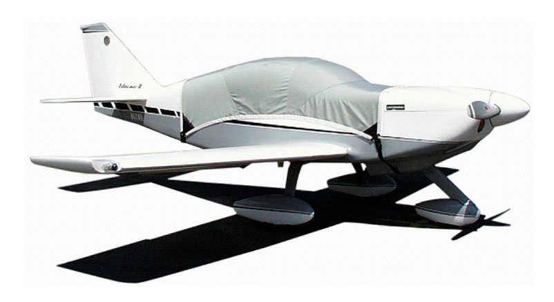
Canopy Cover for the Glasair I

Travel Covers are made with Silver Solution-Dyed Polyester fabric and only lined over the windshield to save weight. The material is lightweight and more compact for easy stowage in the aircraft. The polyester material is water resistant, but only intended for occasional use outside. We also have an ultra lightweight material available for fitted hangar dust covers. For daily outdoor use, the non-travel Sunbrella Cover is the best choice.