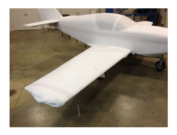
Glasair Aviation Glasair I Complete Fuselage Cover W/Detachable Wing Covers