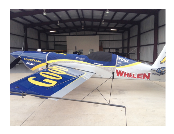
Extra 300SC with NASCAR style custom cover