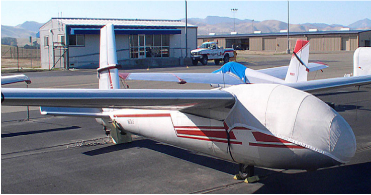
Blanik L13 Canopy/Nose Cover