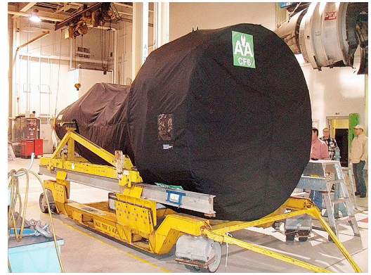
GE CF-6 QEC Engine Long-term Storage/Transport Cover (Boeing 767)