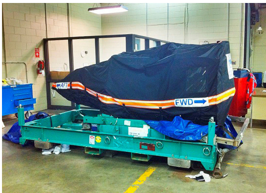
GE CF-34 QEC Engine Long-term Storage/Transport Cover "Bag"