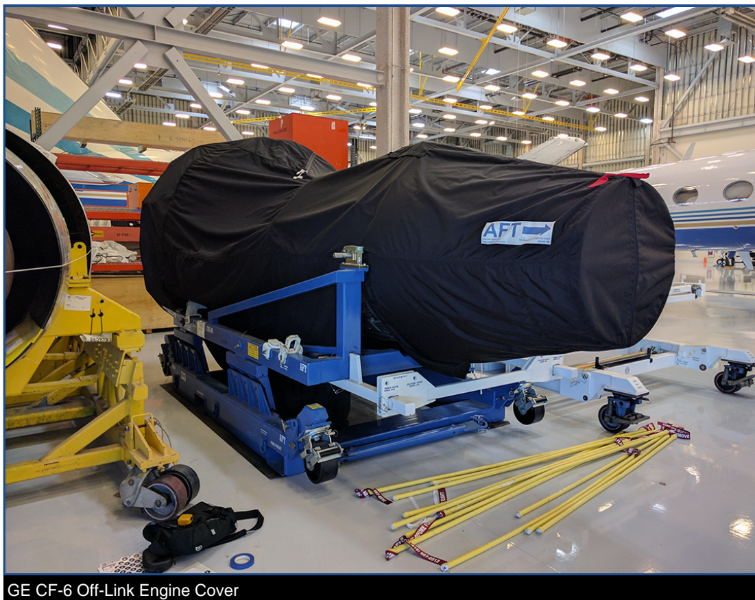
GE CF-6 Off-Link Engine Cover