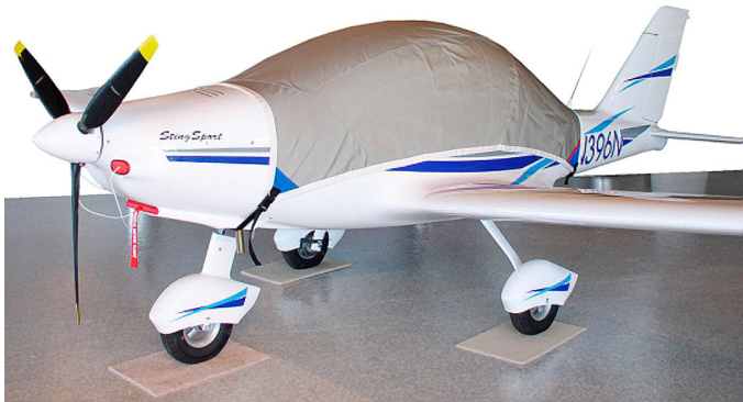
Sting Sport Canopy Cover & Engine Plugs

This cover type is made from Silver Acrylic Sunbrella canvas and is 100% lined with a soft and smooth microfiber. Bruce's Custom Covers developed this material combination especially for aircraft protection. The outer material is medium weight and treated for water resistance, UV resistance and anti-static buildup. The inner lining is a very soft and smooth microfiber to prevent scratching. The material is very reflective, and tests show that the cabin interior temperature can be reduced to near-ambient temperature on the hottest of days. It is water, ice and snow repellent, yet breathable to allow moisture to escape from between the cover and the aircraft surface.