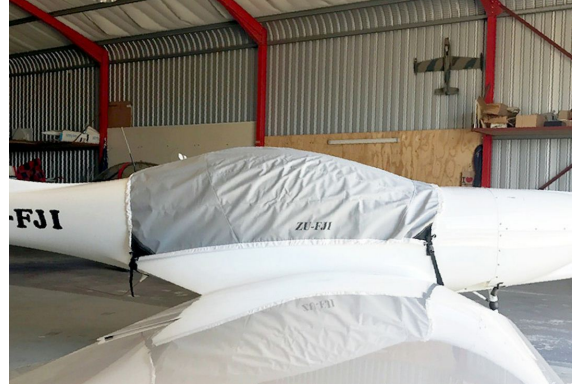
Gobosh 800XP Travel Cover, Light Weight Travel Canopy Cover