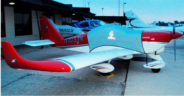
Gobosh Light Weight Travel-Cover

Travel Covers are made with Silver Solution-Dyed Polyester fabric and only lined over the windshield to save weight. The material is lightweight and more compact for easy stowage in the aircraft. The polyester material is water resistant, but only intended for occasional use outside. We also have an ultra lightweight material available for fitted hangar dust covers. For daily outdoor use, the non-travel Sunbrella Cover is the best choice.