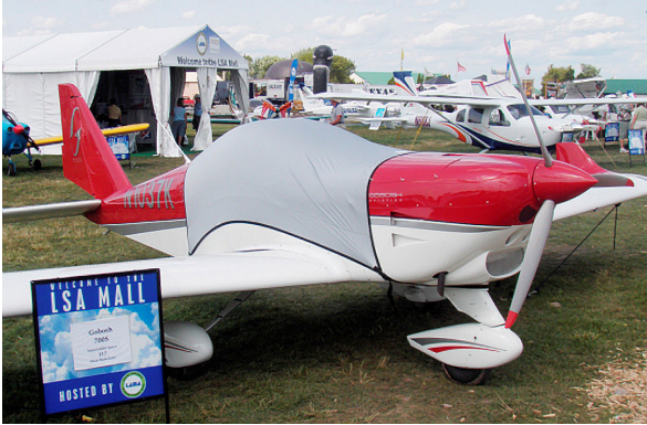
Gobosh GB7 Light Weight Travel-Cover

Travel Covers are made with Silver Solution-Dyed Polyester fabric and only lined over the windshield to save weight. The material is lightweight and more compact for easy stowage in the aircraft. The polyester material is water resistant, but only intended for occasional use outside. We also have an ultra lightweight material available for fitted hangar dust covers. For daily outdoor use, the non-travel Sunbrella Cover is the best choice.