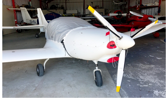
Gobosh 800XP Travel Cover, Light Weight Travel Canopy Cover and Inlet Plugs