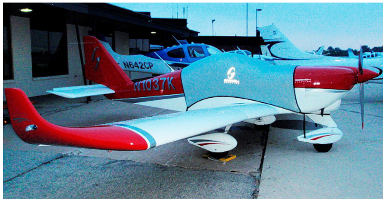
Gobosh Light Weight Travel-Cover

Travel Covers are made with Silver Solution-Dyed Polyester fabric and only lined over the windshield to save weight. The material is lightweight and more compact for easy stowage in the aircraft. The polyester material is water resistant, but only intended for occasional use outside. We also have an ultra lightweight material available for fitted hangar dust covers. For daily outdoor use, the non-travel Sunbrella Cover is the best choice.