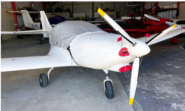
Gobosh 800XP Travel Cover, Light Weight Travel Canopy Cover and Inlet Plugs