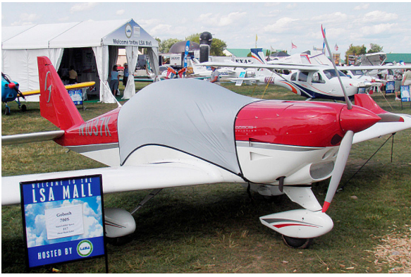
Gobosh GB7 Light Weight Travel-Cover