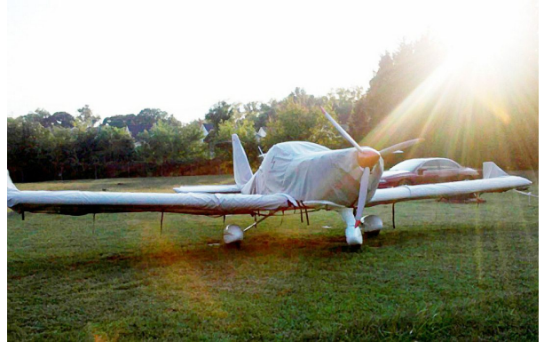
Gobosh Full Cover Set