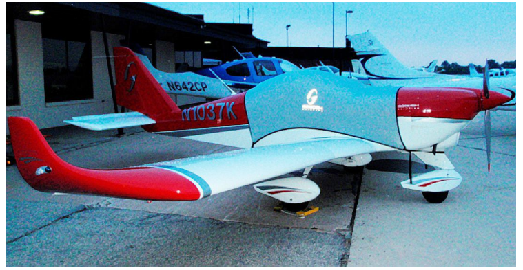
Gobosh Light Weight Travel-Cover