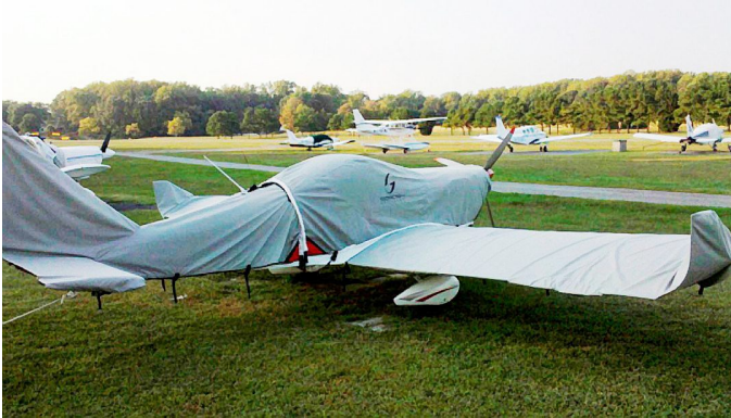
Gobosh Full Cover Set

WINTER USE MATERIAL - Made with Solution-Dyed Polyester fabric, this option is intended for seasonal use to aid in deicing, rain mitigation, or for occasional travel. The material is lighter and more compact, but more susceptible to UV damage and may have a shorter useful life if used continuously outside than the all-year use material.