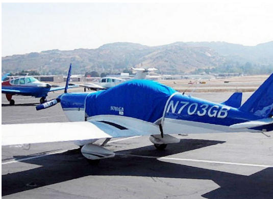
Gobosh 700S Canopy Cover (comes in colors)

This cover type is made from Silver Acrylic Sunbrella canvas and is 100% lined with a soft and smooth microfiber. Bruce's Custom Covers developed this material combination especially for aircraft protection. The outer material is medium weight and treated for water resistance, UV resistance and anti-static buildup. The inner lining is a very soft and smooth microfiber to prevent scratching. The material is very reflective, and tests show that the cabin interior temperature can be reduced to near-ambient temperature on the hottest of days. It is water, ice and snow repellent, yet breathable to allow moisture to escape from between the cover and the aircraft surface.