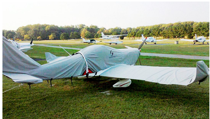
Gobosh Full Cover Set