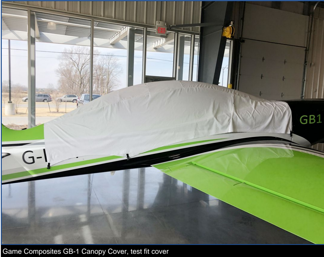
Game Composites GB-1 Canopy Cover, test fit cover