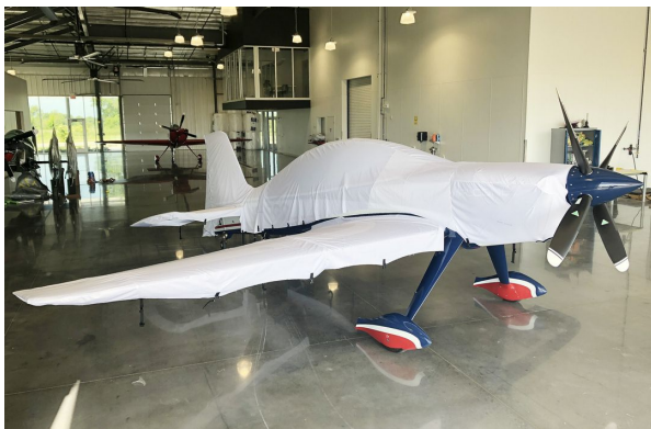
Gamebird GB-1 Extended Canopy/Engine, Wing & Empennage Covers (test fit covers)

Engine Inlet Plugs are custom fit for your Game Composites Gamebird GB-1 intakes, made with heavy-duty vinyl material, and stuffed with a single block of sculpted urethane foam. Each plug has a zipper that allows the foam to be removed and dried if necessary. Engine plugs have warning flags that are visible from the cockpit or 'remove before flight' streamers sewn onto the face of the plugs. Most plugs are imprinted with the aircraft registration number in black for an extra charge. Storage bag NOT included. Engine plugs may be inserted after flight when the engine is still warm. Engine Inlet Plugs are commonly referred to as Cowl Plugs, Intake Plugs, Cowl Blocks, Engine Blocks, and Engine Bungs.