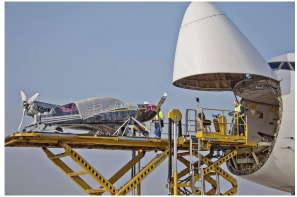
Extra 300 Canopy Cover