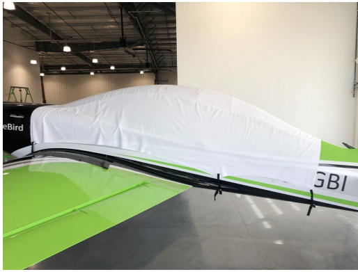
Game Composites GB-1 Canopy Cover, test fit cover