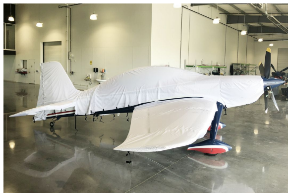
Gamebird GB-1 Extended Canopy/Engine, Wing & Empennage Covers (test fit covers)