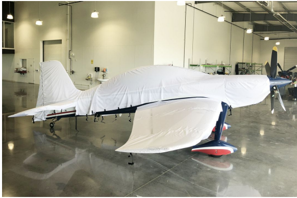
Gamebird GB-1 Extended Canopy/Engine, Wing & Empennage Covers (test fit covers)

This cover type is made from Silver Acrylic Sunbrella canvas and is 100% lined with a soft and smooth microfiber. Bruce's Custom Covers developed this material combination especially for aircraft protection. The outer material is medium weight and treated for water resistance, UV resistance and anti-static buildup. The inner lining is a very soft and smooth microfiber to prevent scratching. The material is very reflective, and tests show that the cabin interior temperature can be reduced to near-ambient temperature on the hottest of days. It is water, ice and snow repellent, yet breathable to allow moisture to escape from between the cover and the aircraft surface.