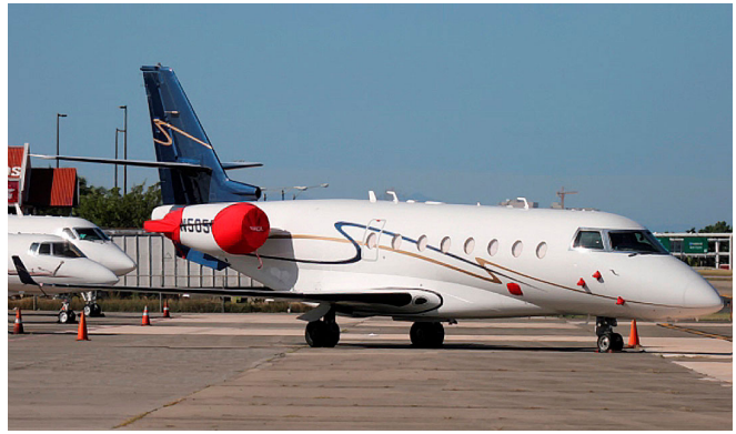
Engine Cover Set for the IAI-1126 Galaxy