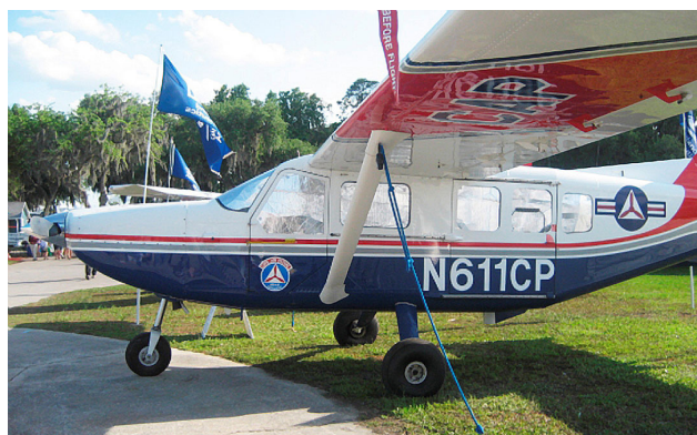
Gippsland GA-8 Airvan Cockpit & Cabin HeatShield Set