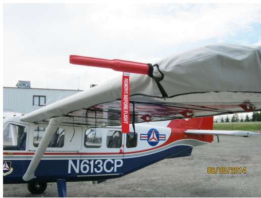
Gippsland GA-8 Airvan Wing Covers, Pitot Cover