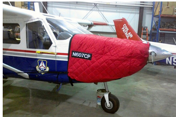
GA-8 Insulated Engine Cover