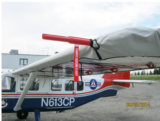
Gippsland GA-8 Airvan Wing Covers, Pitot Cover

mitigation, or for occasional travel. The material is lighter and more compact, but more susceptible to UV damage and may have a shorter useful life if used continuously outside than the all-year use material.