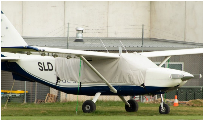
Gippsland GA-8 Canopy Cover