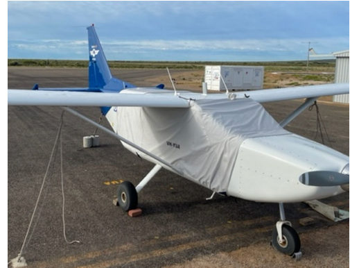
Gippsland GA-8 Extended Canopy Cover