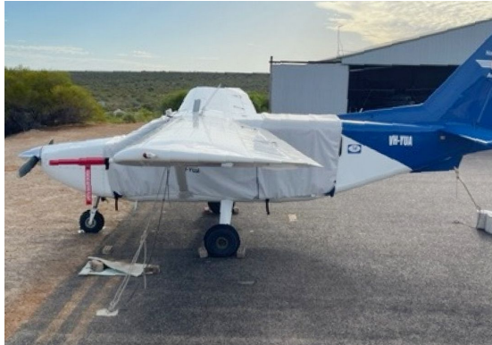
Gippsland GA-8 Extended Canopy Cover

This cover type is made from Silver Acrylic Sunbrella canvas and is 100% lined with a soft and smooth microfiber. Bruce's Custom Covers developed this material combination especially for aircraft protection. The outer material is medium weight and treated for water resistance, UV resistance and anti-static buildup. The inner lining is a very soft and smooth microfiber to prevent scratching. The material is very reflective, and tests show that the cabin interior temperature can be reduced to near-ambient temperature on the hottest of days. It is water, ice and snow repellent, yet breathable to allow moisture to escape from between the cover and the aircraft surface.