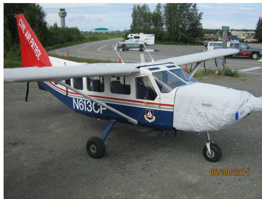
Gippsland GA-8 Airvan Insulated Engine, Wing and Prop Covers