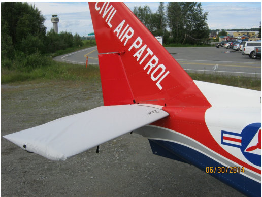
Gippsland GA-8 Airvan Horizontal Stab. Cover

shorter useful life if used continuously outside than the all-year use material.