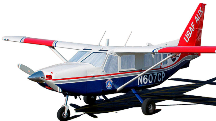
Covers, Plugs & HeatShields for the Gippsland GA-8 Airvan

Cockpit Heatshields are interior sunshades for the aircraft's cockpit. The product is a unique composite of closed-cell foam with a silver mylar finish. The semi-rigid design is stiff enough to stand inside the window framing. The set folds up flat and is easily stored in the included storage sleeve. Some designs may require velcro and suction cups. A Heatshield is an excellent short-term remedy for cockpit overheating, but an external fabric cover is more effective for long-term protection.