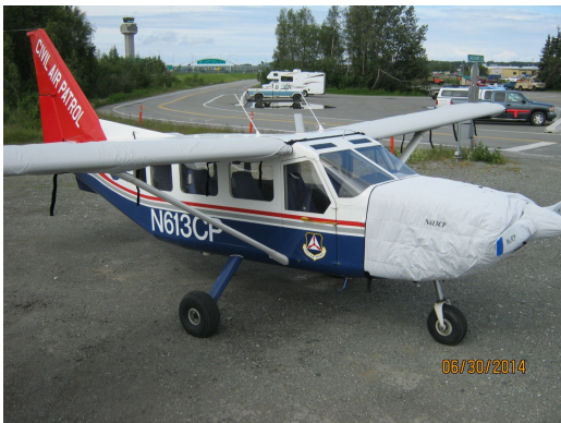
Gippsland GA-8 Airvan Insulated Engine, Wing and Prop Covers

This cover type is made from Silver Acrylic Sunbrella canvas and is 100% lined with a soft and smooth microfiber. Bruce's Custom Covers developed this material combination especially for aircraft protection. The outer material is medium weight and treated for water resistance, UV resistance and anti-static buildup. The inner lining is a very soft and smooth microfiber to prevent scratching. The material is very reflective, and tests show that the cabin interior temperature can be reduced to near-ambient temperature on the hottest of days. It is water, ice and snow repellent, yet breathable to allow moisture to escape from between the cover and the aircraft surface.