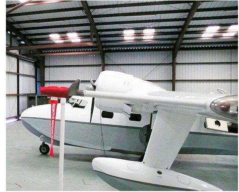
Grumman Mallard Pitot Cover with Install Tool