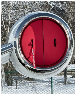
Gulfstream Aerospace Gulfstream GVII (G400,

The Engine Inlet Plugs are custom fit for your Gulfstream Aerospace Gulfstream GVII (G400, G500, G600, G700, G800) intakes, made with heavy-duty vinyl material, and stuffed with a single block of sculpted urethane foam. Each plug has a zipper that allows the foam to be removed and dried if necessary. Engine plugs have 'remove before flight' streamers sewn onto the face of the plugs. Most plugs are imprinted with the aircraft registration number in black for an extra charge. Storage bag NOT included. Engine plugs may be inserted after flight when the engine is still warm. Engine Inlet Plugs are commonly referred to as Cowl Plugs, Intake Plugs, Cowl Blocks, Engine Blocks, and Engine Bungs.