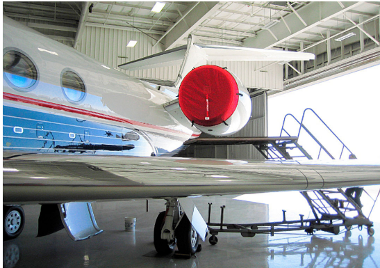
Grumman Gulfstream G550 Engine Intake covers