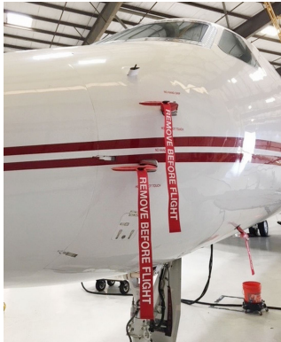
Grumman Gulfstream G-V Pitot Covers

Most plugs are imprinted with the aircraft registration number in black for an extra charge. Storage bag NOT included. Engine plugs may be inserted after flight when the engine is still warm. Engine Inlet Plugs are commonly referred to as Cowl Plugs, Intake Plugs, Cowl Blocks, Engine Blocks, and Engine Bunges.