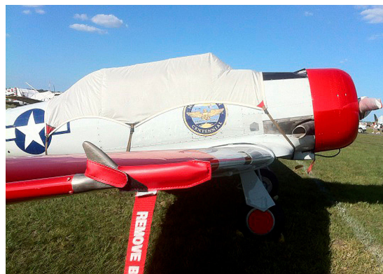
T6 Pitot, Canopy & Prop Covers

Grumman Widgeon G-44 Pitot Tube Covers , NOT HEAT RESISTANT TYPE, are made of Naugahyde vinyl, and are designed to cover the entire pitot assembly. Slipping over the tube, the cover tightens around the base with a Velcro strap detail. A "Remove Before Flight" streamer is attached to the cover. Heat Resistant Pitot Covers are an upgrade to this design, and help prevent the pitot cover from melting onto the tube if the pitot heat is accidentally turned on while installed. If you want the set tethered together, please let us know.