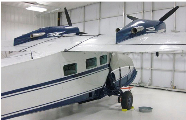
Grumman G44 Widgeon Cockpit/Nose Cover