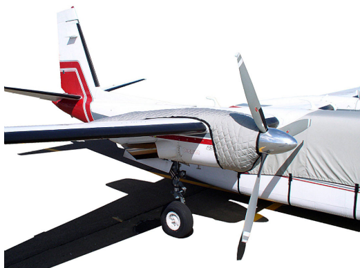
Aero Commander Insulated Engine Cover

The material is very reflective, and tests show that the cabin interior temperature can be reduced to near-ambient temperature on the hottest of days. It is water, ice and snow repellent, yet breathable to allow moisture to escape from between the cover and the aircraft surface.