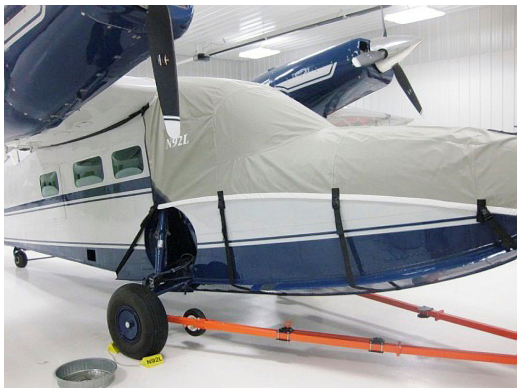
Grumman G44 Widgeon Cockpit/Nose Cover

This cover type is made from Silver Acrylic Sunbrella canvas and is 100% lined with a soft and smooth microfiber. Bruce's Custom Covers developed this material combination especially for aircraft protection. The outer material is medium weight and treated for water resistance, UV resistance and anti-static buildup. The inner lining is a very soft and smooth microfiber to prevent scratching. The material is very reflective, and tests show that the cabin interior temperature can be reduced to near-ambient temperature on the hottest of days. It is water, ice and snow repellent, yet breathable to allow moisture to escape from between the cover and the aircraft surface.