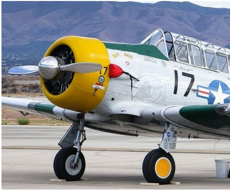
North American T6 Carb Air Scoop Cover