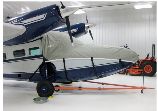
Grumman G44 Widgeon Cockpit/Nose Cover