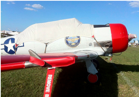
T6 Pitot, Canopy & Prop Covers

Grumman Widgeon G-44 Pitot Tube Covers , NOT HEAT RESISTANT TYPE, are made of Naugahyde vinyl, and are designed to cover the entire pitot assembly. Slipping over the tube, the cover tightens around the base with a Velcro strap detail. A "Remove Before Flight" streamer is attached to the cover. Heat Resistant Pitot Covers are an upgrade to this design, and help prevent the pitot cover from melting onto the tube if the pitot heat is accidentally turned on while installed. If you want the set tethered together, please let us know.