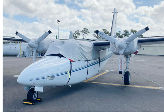
Aero Commander 500S Shrike Canopy, Engine & Prop Covers