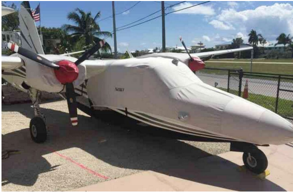
Twin Commander 560F Canopy/Nose & Engine Covers

The material is very reflective, and tests show that the cabin interior temperature can be reduced to near-ambient temperature on the hottest of days. It is water, ice and snow repellent, yet breathable to allow moisture to escape from between the cover and the aircraft surface.