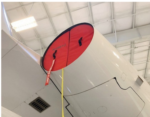
Grumman Gulfstream G-V Exhaust Plugs

The Engine Inlet Plugs are custom fit for your Gulfstream Aerospace Gulfstream IV (C-20G), G350, G450 intakes, made with heavy-duty vinyl material, and stuffed with a single block of sculpted urethane foam. Each plug has a zipper that allows the foam to be removed and dried if necessary. Engine plugs have 'remove before flight' streamers sewn onto the face of the plugs. Most plugs are imprinted with the aircraft registration number in black for an extra charge. Storage bag NOT included. Engine plugs may be inserted after flight when the engine is still warm. Engine Inlet Plugs are commonly referred to as Cowl Plugs, Intake Plugs, Cowl Blocks, Engine Blocks, and Engine Bunges.