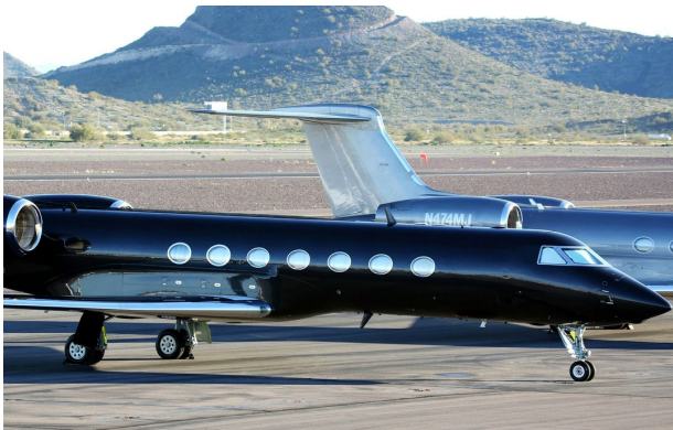
Gulfstream Cockpit Heatshields

Cockpit Heatshields are interior sunshades for the aircraft's cockpit. The product is a unique composite of closed-cell foam with a silver mylar finish. The semi-rigid design is stiff enough to stand inside the window framing. The set folds up flat and is easily stored in the included storage sleeve. Some designs may require velcro and suction cups. Our Heatshields for jets are offered white side out because some aircraft manufacturers have issued advisories against reflective window inserts due to potential heat damage. A Heatshield is an excellent short-term remedy for cockpit overheating, but an external fabric cover is more effective for long-term protection.