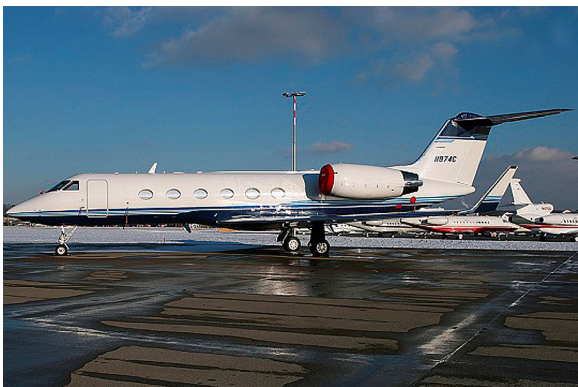
Gulfstream G-IV Intake Covers

The Gulfstream Aerospace Gulfstream IV (C-20G), G350, G450 Intake Covers are designed to install easily yet be completely storable. A spring steel hoop is sewn into the hem of each cover, allowing them to be installed without climbing onto the wing or using a stepladder. To store the covers the spring steel hoop folds like a band-saw blade into three nesting rings. Each cover folds into a compact circular bundle which is stored in the included duffle bag, yet they unfold quickly for use. The Tri-Fold Ring cover is made of medium weight nylon which is available in a variety of colors to match the paint trim. Each cover set comes complete with installation and folding instructions. The aircraft's registration number can be silkscreened onto the cover for an extra charge.