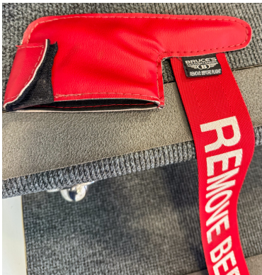
Gulfstream IV Pitot Cover

The Engine Inlet Plugs are custom fit for your Gulfstream Aerospace Gulfstream IV (C-20G), G350, G450 intakes, made with heavy-duty vinyl material, and stuffed with a single block of sculpted urethane foam. Each plug has a zipper that allows the foam to be removed and dried if necessary. Engine plugs have 'remove before flight' streamers sewn onto the face of the plugs. Most plugs are imprinted with the aircraft registration number in black for an extra charge. Storage bag NOT included. Engine plugs may be inserted after flight when the engine is still warm. Engine Inlet Plugs are commonly referred to as Cowl Plugs, Intake Plugs, Cowl Blocks, Engine Blocks, and Engine Bunges.