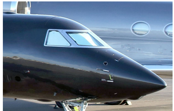
Gulfstream Cockpit Heatshields