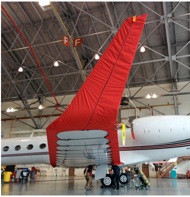
Gulfstream G550 Wing/Winglet Covers