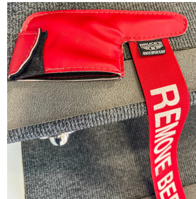
Gulfstream IV Pitot Cover