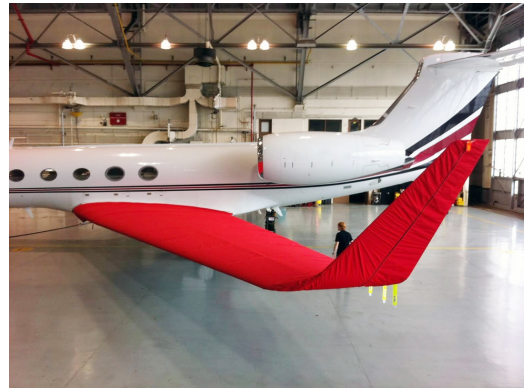
Gulfstream G550 Wing/Winglet Covers