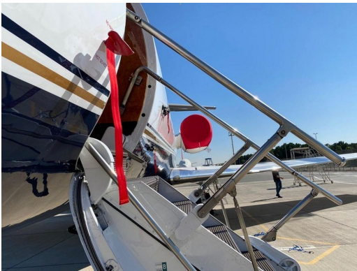
Grumman Gulfstream G-IV SP Pitot Cover

The Engine Inlet Plugs are custom fit for your Gulfstream Aerospace Gulfstream IV (C-20G), G350, G450 intakes, made with heavy-duty vinyl material, and stuffed with a single block of sculpted urethane foam. Each plug has a zipper that allows the foam to be removed and dried if necessary. Engine plugs have 'remove before flight' streamers sewn onto the face of the plugs. Most plugs are imprinted with the aircraft registration number in black for an extra charge. Storage bag NOT included. Engine plugs may be inserted after flight when the engine is still warm. Engine Inlet Plugs are commonly referred to as Cowl Plugs, Intake Plugs, Cowl Blocks, Engine Blocks, and Engine Bunges.