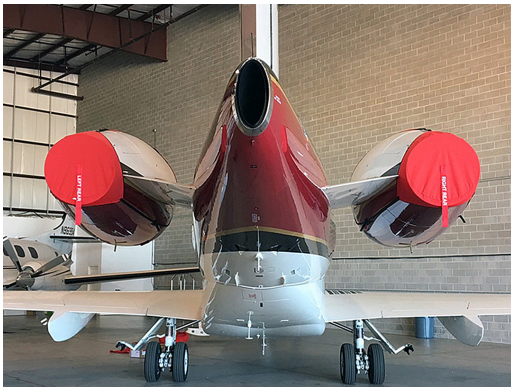
Canadair Challenger 300 Intake/Exhaust Covers, 3-Strap Type

The Gulfstream Aerospace Gulfstream IV (C-20G), G350, G450 Intake Covers are designed to install easily yet be completely storable. A spring steel hoop is sewn into the hem of each cover, allowing them to be installed without climbing onto the wing or using a stepladder. To store the covers the spring steel hoop folds like a band-saw blade into three nesting rings. Each cover folds into a compact circular bundle which is stored in the included duffle bag, yet they unfold quickly for use. The Tri-Fold Ring cover is made of medium weight nylon which is available in a variety of colors to match the paint trim. Each cover set comes complete with installation and folding instructions. The aircraft's registration number can be silkscreened onto the cover for an extra charge.