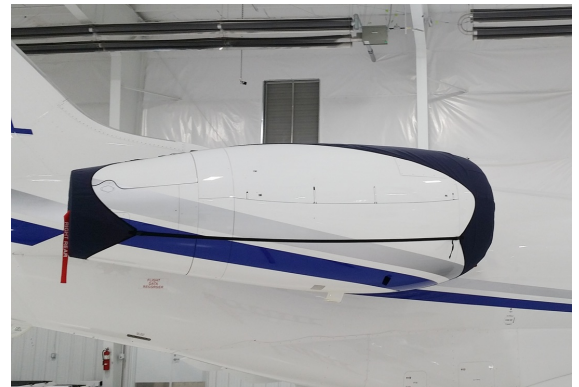
Challenger 300 Intake/Exhaust Cover Set, 3-strap type