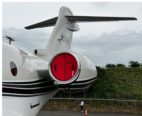
Gulfstream G280 Intake Plugs