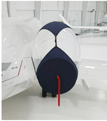
Challenger 300 Intake/Exhaust Cover Set, 3-strap type