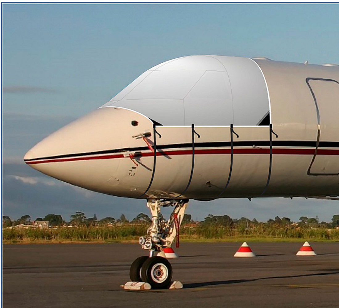
G-V Cockpit/Windshield Cover (Illustration)