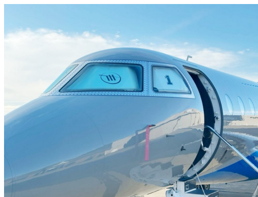
Gulfstream G200 Cockpit Heatshields