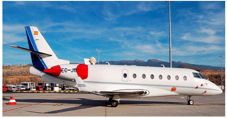
Gulfstream 200 Engine Cover set