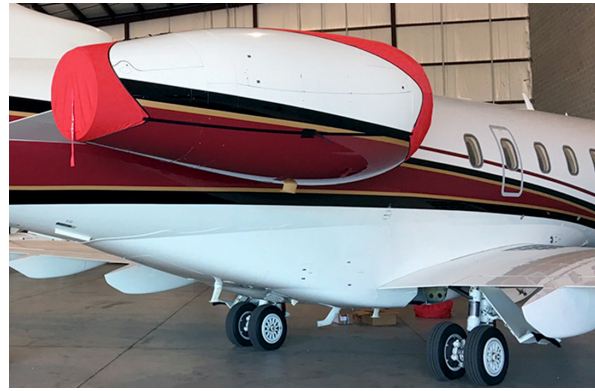
Intake/Exhaust Covers, 3-Strap Type. Successfully installed by two crew, one ladder.