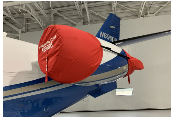
Grumman Gulfstream G200, G280 Engine Cover Set, G200 Model