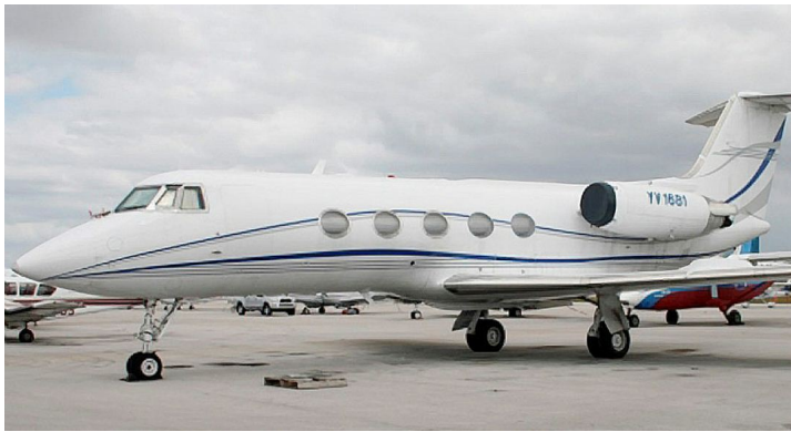
Gulfstream G2 Intake Covers (Come in colors) & Cockpit HeatShield Set

The Gulfstream Aerospace Gulfstream II, III (C-20D) Intake Covers are designed to install easily yet be completely storable. A spring steel hoop is sewn into the hem of each cover, allowing them to be installed without climbing onto the wing or using a stepladder. To store the covers the spring steel hoop folds like a band-saw blade into three nesting rings. Each cover folds into a compact circular bundle which is stored in the included duffle bag, yet they unfold quickly for use. The Tri-Fold Ring cover is made of medium weight nylon which is available in a variety of colors to match the paint trim. Each cover set comes complete with installation and folding instructions. The aircraft's registration number can be silkscreened onto the cover for an extra charge.