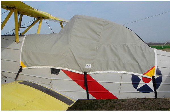
Grumman Ag-Cat Canopy Cover