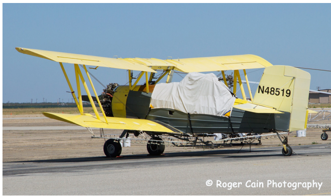
Grumman AG Cat Canopy Cover