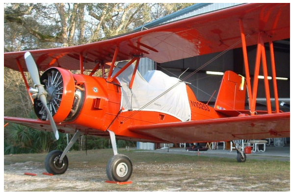
Grumman Ag Cat G-164, Open Cockpit, Canopy Cover