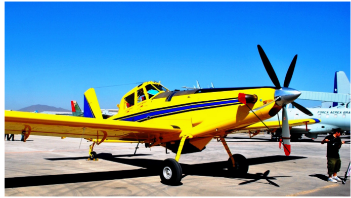
Air Tractor Prop Tie/Exhaust Covers