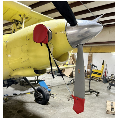
Schweizer Ag-Cat Prop Tie/Exhaust Cover Set