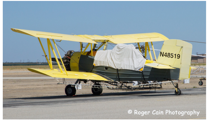
Grumman AG Cat Canopy Cover