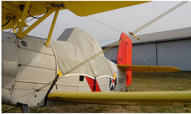
Ag-Cat Canopy Cover