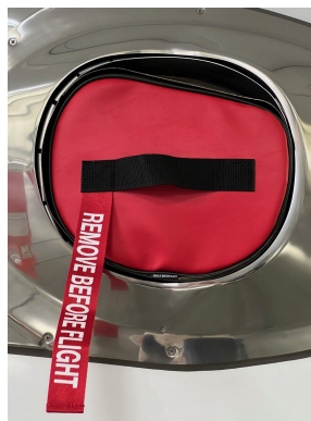
Gulfstream V APU Exhaust Plug

The Engine Inlet Plugs are custom fit for your Gulfstream Aerospace Gulfstream G150 intakes, made with heavy-duty vinyl material, and stuffed with a single block of sculpted urethane foam. Each plug has a zipper that allows the foam to be removed and dried if necessary. Engine plugs have 'remove before flight' streamers sewn onto the face of the plugs. Most plugs are imprinted with the aircraft registration number in black for an extra charge. Storage bag NOT included. Engine plugs may be inserted after flight when the engine is still warm. Engine Inlet Plugs are commonly referred to as Cowl Plugs, Intake Plugs, Cowl Blocks, Engine Blocks, and Engine Bungs.