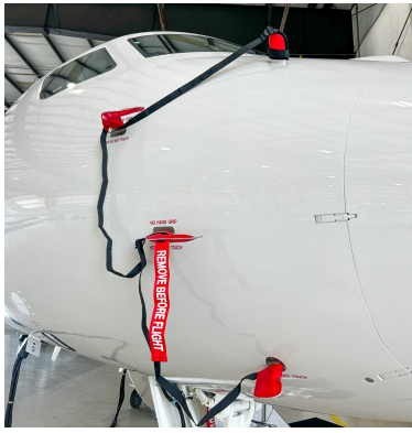
Gulfstream GVII Pitot Probes/TAT/Ice Detector Set, Heat Resistant Type