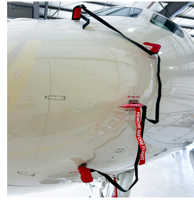
Gulfstream GVII Pitot Probes/TAT/Ice Detector Set, Heat Resistant Type