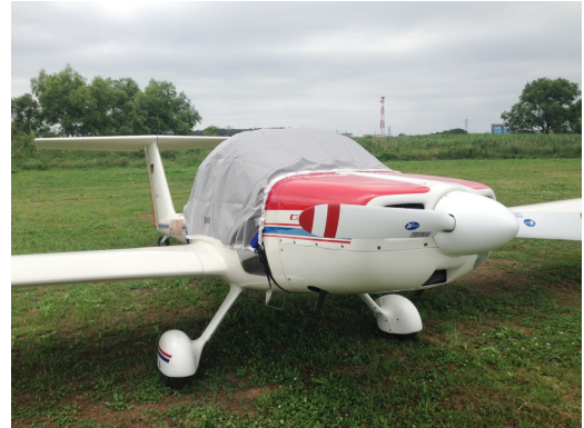
Grob 109 Travel Cover, Light Weight Travel Canopy Cover