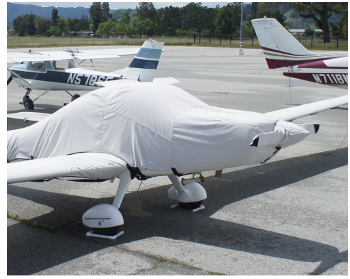
Grob 109 Prop Cover