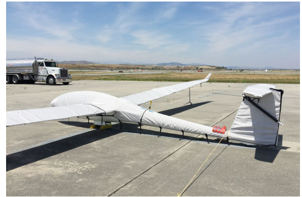
Schemp-Hirth Discus 2B Full Cover Set