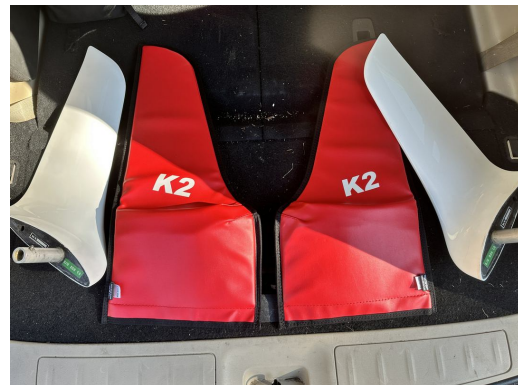
Discus CS Wingtip Pads (Set of 2)