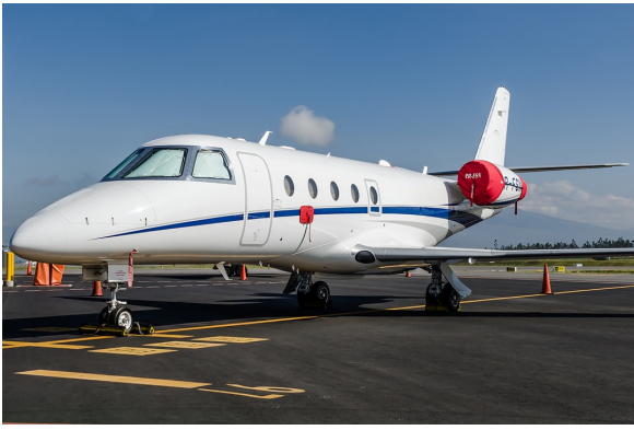
Gulfstream G150 Engine Covers, Cockpit HeatShields