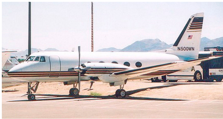
Covers, Plugs, HeatShields and related items for the Grumman Gulfstream I