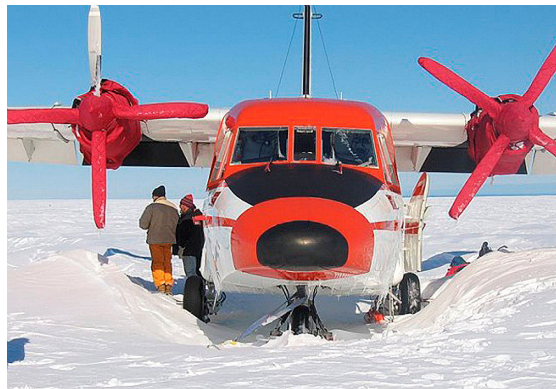
Casa 212 Insulated Engine & Propeller/Spinner Covers