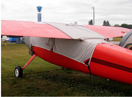
Over-Top Canopy Cover & Engine Cover

The material is very reflective, and tests show that the cabin interior temperature can be reduced to near-ambient temperature on the hottest of days. It is water, ice and snow repellent, yet breathable to allow moisture to escape from between the cover and the aircraft surface.