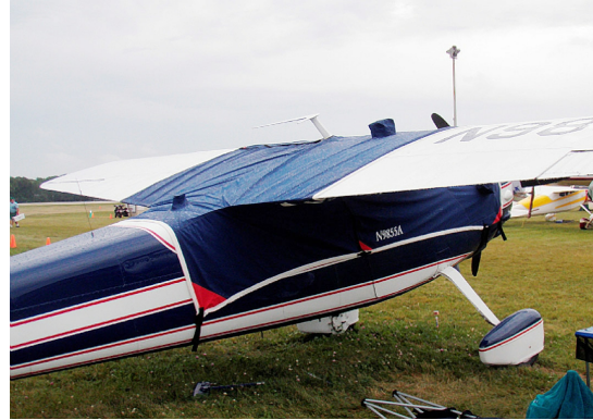
Cessna 195 Canopy Cover, extended forward and over gas caps