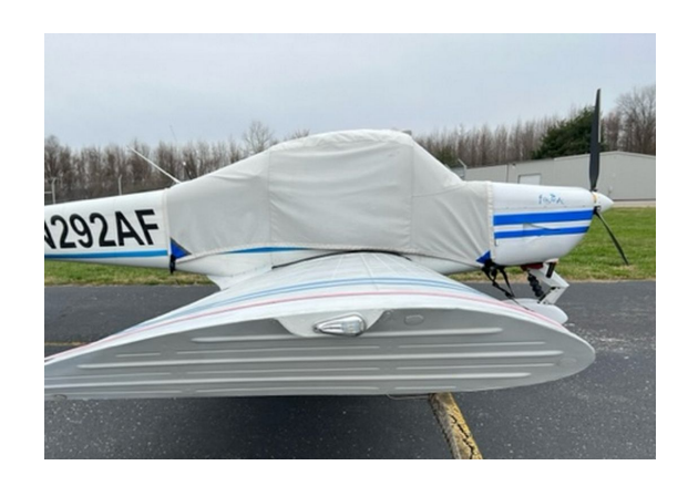
SC Aerostar Festival Canopy Cover