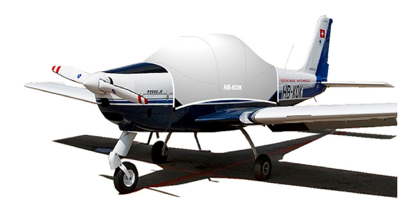
Aerostar Festival Canopy Cover (similar to Tecnam Sierra )

This cover type is made from Silver Acrylic Sunbrella canvas and is 100% lined with a soft and smooth microfiber. Bruce's Custom Covers developed this material combination especially for aircraft protection. The outer material is medium weight and treated for water resistance, UV resistance and anti-static buildup. The inner lining is a very soft and smooth microfiber to prevent scratching. The material is very reflective, and tests show that the cabin interior temperature can be reduced to near-ambient temperature on the hottest of days. It is water, ice and snow repellent, yet breathable to allow moisture to escape from between the cover and the aircraft surface.