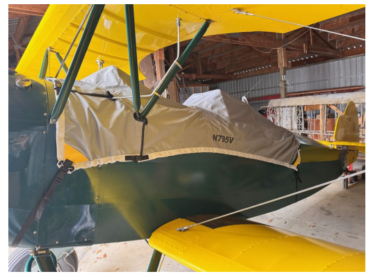
Fleet Model 7 Canopy Cover, Travel Weight