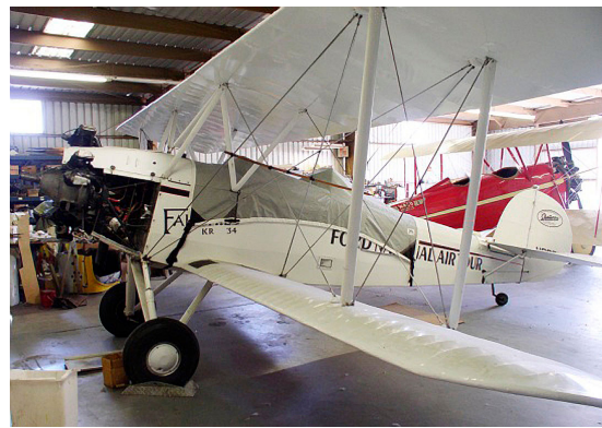
Fairchild KR-34 Canopy Cover