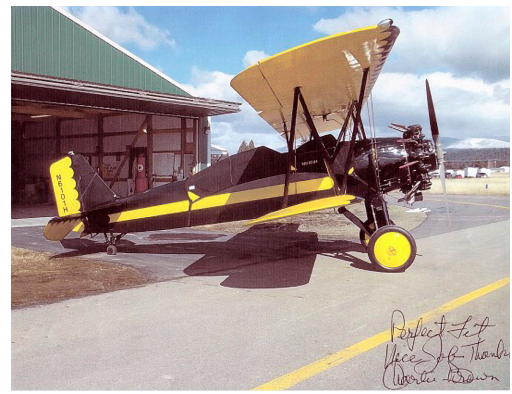
Stearman C3 Canopy Cover