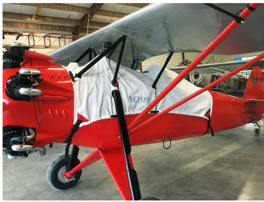
Davis D-1K Canopy Cover