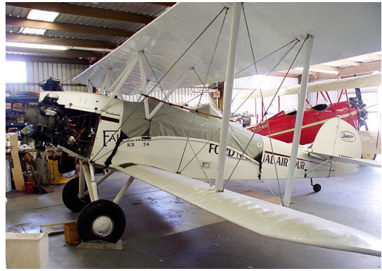
Fairchild KR-34 Canopy Cover