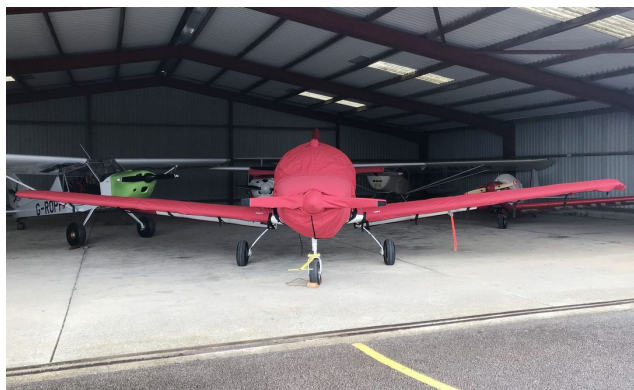
FLS Club Sprint Empennage Cover (Tailboom, Vertical & Horiz Stabilizers) All Year Use

Engine Covers will cinch around or behind the spinner, cover the entire engine cowl area including the engine air cooling and induction air inlets, and fastens together with Velcro beneath the spinner down the front of the cowling. The Engine Cover is attached with a belly strap aft of the firewall, and can Velcro to the Canopy Cover. Engine Covers are normally made from Solution-Dyed Polyester or Acrylic Sunbrella . An Insulated version of the engine cover can be made with a thicker, quilted, and water-repellent material. The Insulated Engine Cover works well in cold climates to help with engine preheating.