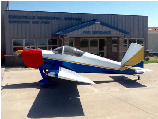
Van's RV-7 Insulated Engine Cover