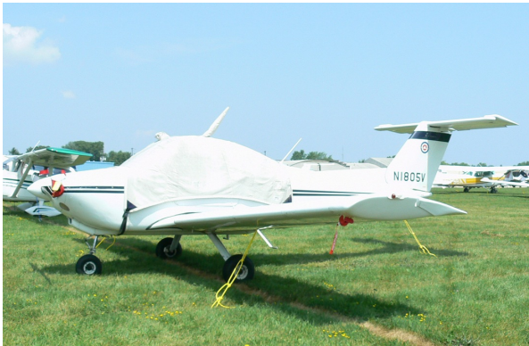
Beech Skipper Canopy Cover, Engine Plugs

Covers developed this material combination especially for aircraft protection. The outer material is medium weight and treated for water resistance, UV resistance and anti-static buildup. The inner lining is a very soft and smooth microfiber to prevent scratching. The material is very reflective, and tests show that the cabin interior temperature can be reduced to near-ambient temperature on the hottest of days. It is water, ice and snow repellent, yet breathable to allow moisture to escape from between the cover and the aircraft surface.