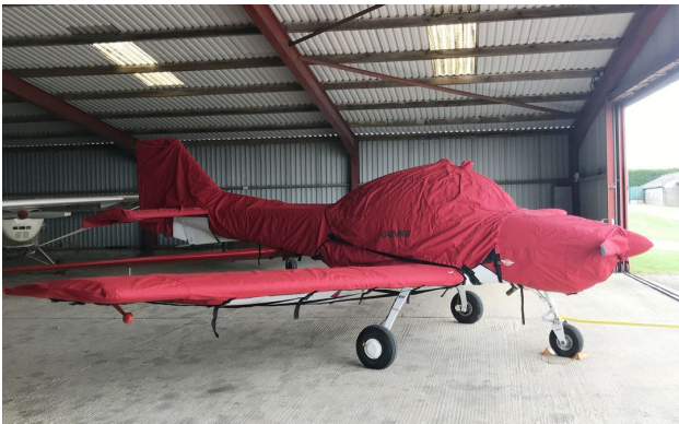
FLS Club Sprint Extended Canopy Cover

WINTER USE MATERIAL - Made with Solution-Dyed Polyester fabric, this option is intended for seasonal use to aid in deicing, rain mitigation, or for occasional travel. The material is lighter and more compact, but more susceptible to UV damage and may have a shorter useful life if used continuously outside than the all-year use material.