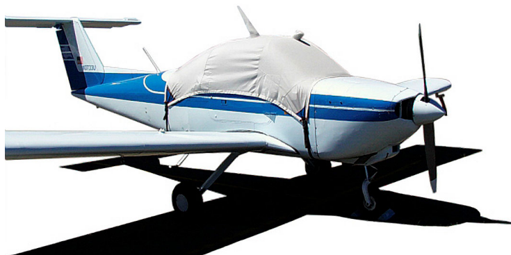
Canopy Cover for Beech Skipper