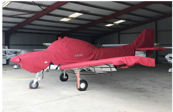
FLS Club Sprint Engine Cover