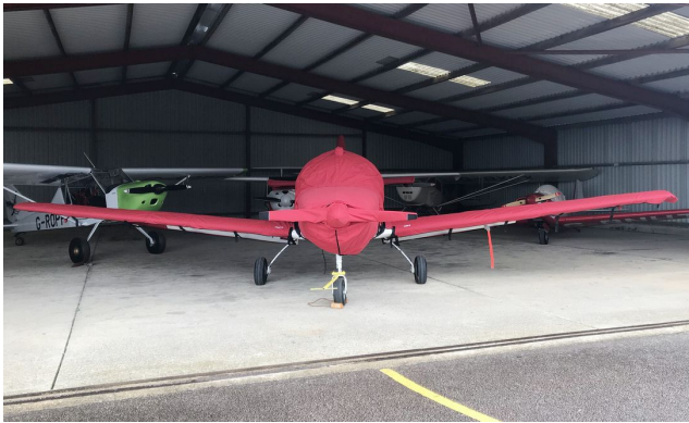
FLS Club Sprint Empennage Cover (Tailboom, Vertical & Horiz Stabilizers) All Year Use