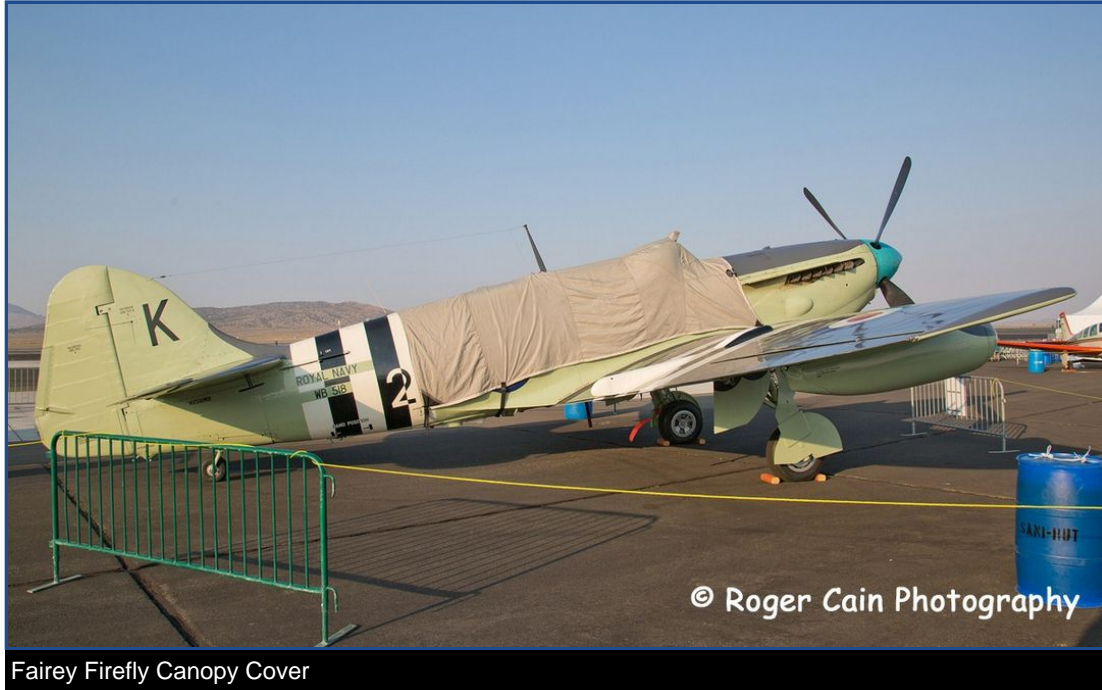
Fairey Firefly Canopy Cover