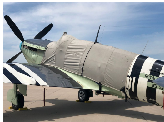
Fairey Firefly Canopy Cover