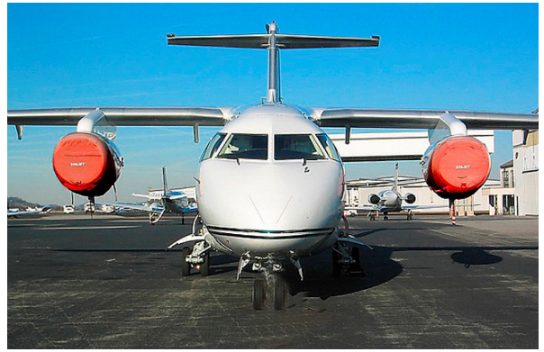
Fairchild /Dornier 328 Engine Covers