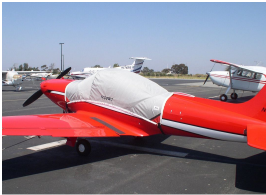
Falco Canopy Cover

This cover type is made from Silver Acrylic Sunbrella canvas and is 100% lined with a soft and smooth microfiber. Bruce's Custom Covers developed this material combination especially for aircraft protection. The outer material is medium weight and treated for water resistance, UV resistance and anti-static buildup. The inner lining is a very soft and smooth microfiber to prevent scratching. The material is very reflective, and tests show that the cabin interior temperature can be reduced to near-ambient temperature on the hottest of days. It is water, ice and snow repellent, yet breathable to allow moisture to escape from between the cover and the aircraft surface.