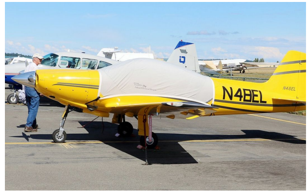
Falco Canopy Cover