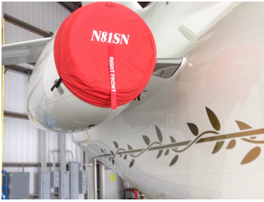
Falcon 900EX Intake Cover