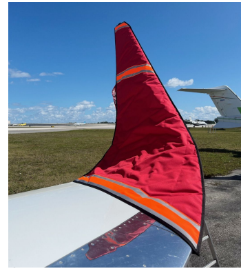
Falcon Jet 900 Winglet Padding Covers