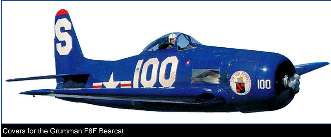
Covers for the Grumman F8F Bearcat