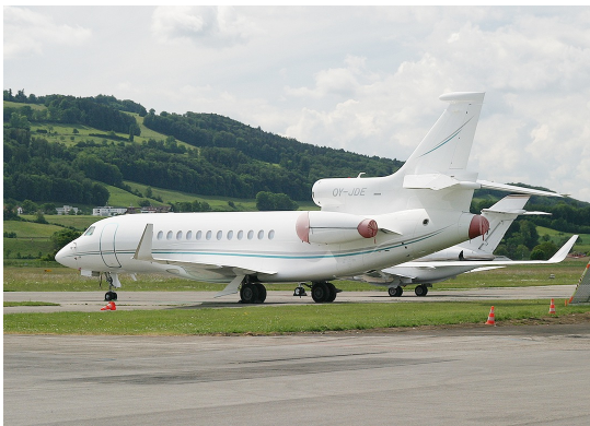
Falcon 7X Engine Cover Set

The Falcon Jet 7X Intake Covers are designed to install easily yet be completely storable. A spring steel hoop is sewn into the hem of each cover, allowing them to be installed without climbing onto the wing or using a stepladder. To store the covers the spring steel hoop folds like a band-saw blade into three nesting rings. Each cover folds into a compact circular bundle which is stored in the included duffle bag, yet they unfold quickly for use. The Tri-Fold Ring cover is made of medium weight nylon which is available in a variety of colors to match the paint trim. Each cover set comes complete with installation and folding instructions. The aircraft's registration number can be silkscreened onto the cover for an extra charge.