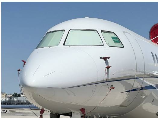
Falcon Jet 7X Cockpit Heatshields

Cockpit Heatshields are interior sunshades for the aircraft's cockpit. The product is a unique composite of closed-cell foam with a silver mylar finish. The semi-rigid design is stiff enough to stand inside the window framing. The set folds up flat and is easily stored in the included storage sleeve. Some designs may require velcro and suction cups. Our Heatshields for jets are offered white side out because some aircraft manufacturers have issued advisories against reflective window inserts due to potential heat damage. A Heatshield is an excellent short-term remedy for cockpit overheating, but an external fabric cover is more effective for long-term protection.