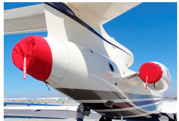
Falcon 7X Exhaust Covers