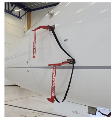
Falcon 7X Pitot & TAT covers