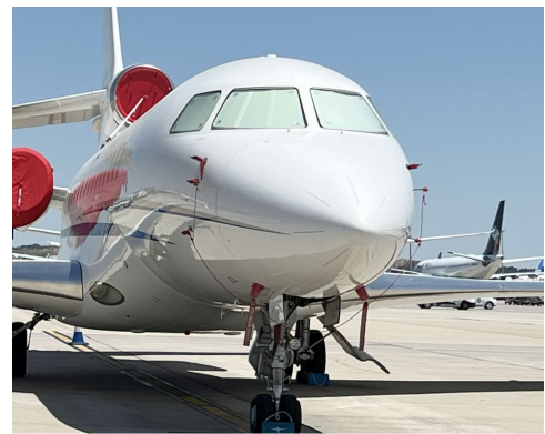
Falcon Jet 7X Cockpit Heatshields