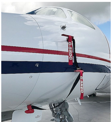
Falcon Jet 7X Pitot Probe/Aoa Set, Heat Resistant Type

The Engine Inlet Plugs are custom fit for your Falcon Jet 7X intakes, made with heavy-duty vinyl material, and stuffed with a single block of sculpted urethane foam. Each plug has a zipper that allows the foam to be removed and dried if necessary. Engine plugs have 'remove before flight' streamers sewn onto the face of the plugs. Most plugs are imprinted with the aircraft registration number in black for an extra charge. Storage bag NOT included. Engine plugs may be inserted after flight when the engine is still warm. Engine Inlet Plugs are commonly referred to as Cowl Plugs, Intake Plugs, Cowl Blocks, Engine Blocks, and Engine Bungs.