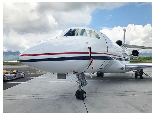
Falcon Jet 7X Pitot Probe/Aoa Set, Heat Resistant Type