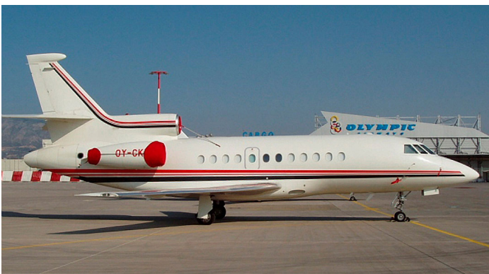
Falcon 900 Engine Covers

The Falcon Jet 50EX Bikini Style Engine Covers are a single-piece design using a soft and smooth stretchy and fabric. The cover stretches tightly over both the intake and exhaust, installing quickly and easily. These covers are designed to be used as hangar dust covers and have a useful life of approximately one year.