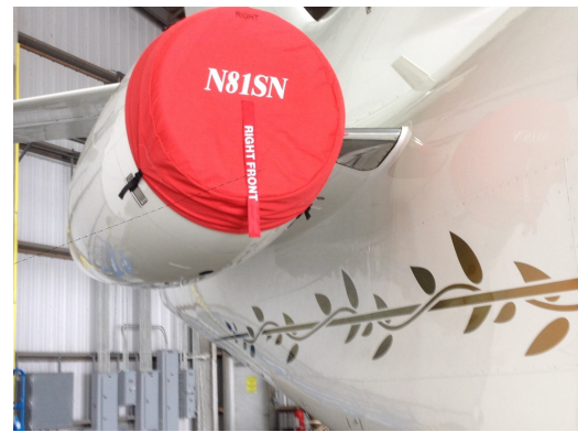
Falcon 900EX Intake Cover