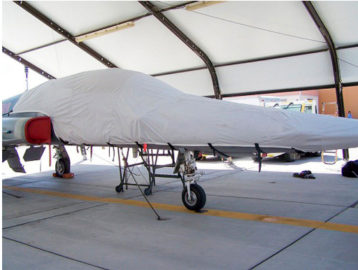
Northrup F5 Talon Canopy Cover

This cover type is made from Silver Acrylic Sunbrella canvas and is 100% lined with a soft and smooth microfiber. Bruce's Custom Covers developed this material combination especially for aircraft protection. The outer material is medium weight and treated for water resistance, UV resistance and anti-static buildup. The inner lining is a very soft and smooth microfiber to prevent scratching. The material is very reflective, and tests show that the cabin interior temperature can be reduced to near-ambient temperature on the hottest of days. It is water, ice and snow repellent, yet breathable to allow moisture to escape from between the cover and the aircraft surface.