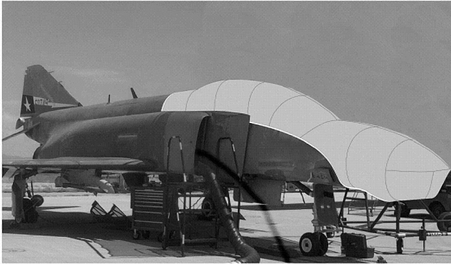
F4 Phantom Canopy/Nose Cover

This cover type is made from Silver Acrylic Sunbrella canvas and is 100% lined with a soft and smooth microfiber. Bruce's Custom Covers developed this material combination especially for aircraft protection. The outer material is medium weight and treated for water resistance, UV resistance and anti-static buildup. The inner lining is a very soft and smooth microfiber to prevent scratching. The material is very reflective, and tests show that the cabin interior temperature can be reduced to near-ambient temperature on the hottest of days. It is water, ice and snow repellent, yet breathable to allow moisture to escape from between the cover and the aircraft surface.