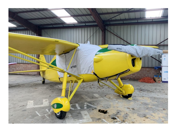
Fairchild 24 Over-Top Canopy Cover

Travel Covers are made with Silver Solution-Dyed Polyester fabric and only lined over the windshield to save weight. The material is lightweight and more compact for easy stowage in the aircraft. The polyester material is water resistant, but only intended for occasional use outside. We also have an ultra lightweight material available for fitted hangar dust covers. For daily outdoor use, the non-travel Sunbrella Cover is the best choice.