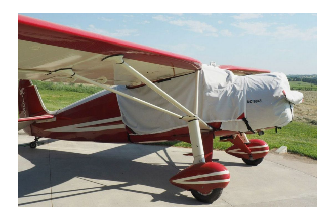
Fairchild 24W Canopy, Engine & Prop Cover

This cover type is made from Silver Acrylic Sunbrella canvas and is 100% lined with a soft and smooth microfiber. Bruce's Custom Covers developed this material combination especially for aircraft protection. The outer material is medium weight and treated for water resistance, UV resistance and anti-static buildup. The inner lining is a very soft and smooth microfiber to prevent scratching. The material is very reflective, and tests show that the cabin interior temperature can be reduced to near-ambient temperature on the hottest of days. It is water, ice and snow repellent, yet breathable to allow moisture to escape from between the cover and the aircraft surface.