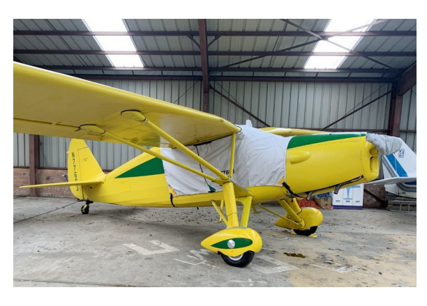
Fairchild 24 Over-Top Canopy Cover, Prop Cover