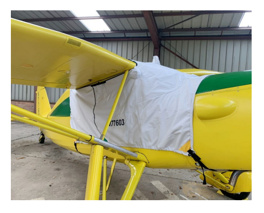
Fairchild 24 Over-Top Canopy Cover

This cover type is made from Silver Acrylic Sunbrella canvas and is 100% lined with a soft and smooth microfiber. Bruce's Custom Covers developed this material combination especially for aircraft protection. The outer material is medium weight and treated for water resistance, UV resistance and anti-static buildup. The inner lining is a very soft and smooth microfiber to prevent scratching. The material is very reflective, and tests show that the cabin interior temperature can be reduced to near-ambient temperature on the hottest of days. It is water, ice and snow repellent, yet breathable to allow moisture to escape from between the cover and the aircraft surface.