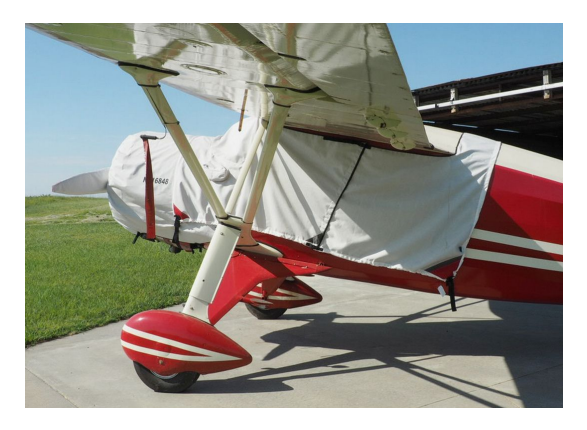
Fairchild 24W Canopy & Engine Cover