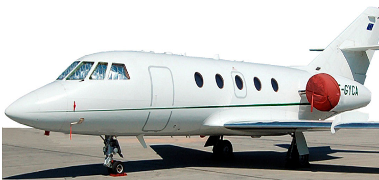
Falcon Engine Cover & Cockpit HeatShields

The Falcon Jet 20 (HU-25) Bikini Style Engine Covers are a single-piece design using a soft and smooth stretchy and fabric. The cover stretches tightly over both the intake and exhaust, installing quickly and easily. These covers are designed to be used as hangar dust covers and have a useful life of approximately one year.