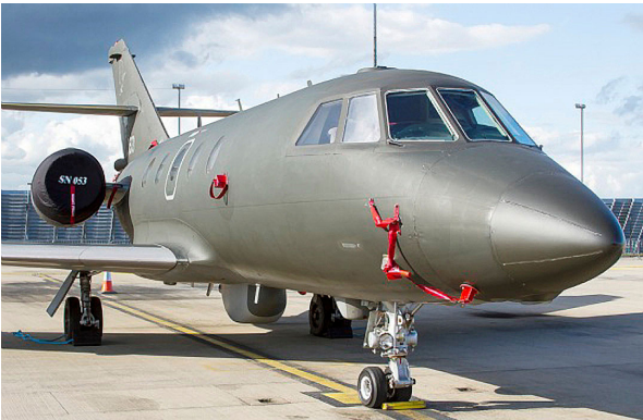
Falcon Engine Covers (not our probe covers)

The Falcon Jet 20 (HU-25) Intake/Exhaust Plugs are custom fit for the intake and exhaust openings, made with heavy-duty vinyl material, and stuffed with a single block of sculpted urethane foam. Each plug has a zipper that allows the foam to be removed and dried if necessary. Engine plugs have 'remove before flight' streamers sewn onto the face of the plugs. Most plugs are imprinted with the aircraft registration number in black. Engine plugs may be inserted after flight when the engine is still warm. Engine Inlet Plugs are commonly referred to as Cowl Plugs, Intake Plugs, Cowl Blocks, Engine Blocks, and Engine Bungs.