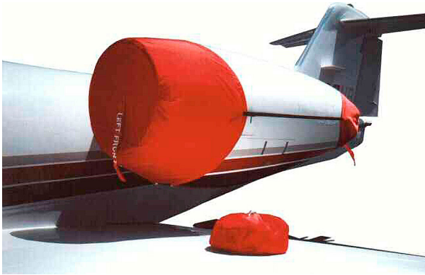
Lear 30 Tri-Fold Engine Cover

The Falcon Jet 20 (HU-25) Bikini Style Engine Covers are a single-piece design using a soft and smooth stretchy and fabric. The cover stretches tightly over both the intake and exhaust, installing quickly and easily. These covers are designed to be used as hangar dust covers and have a useful life of approximately one year.