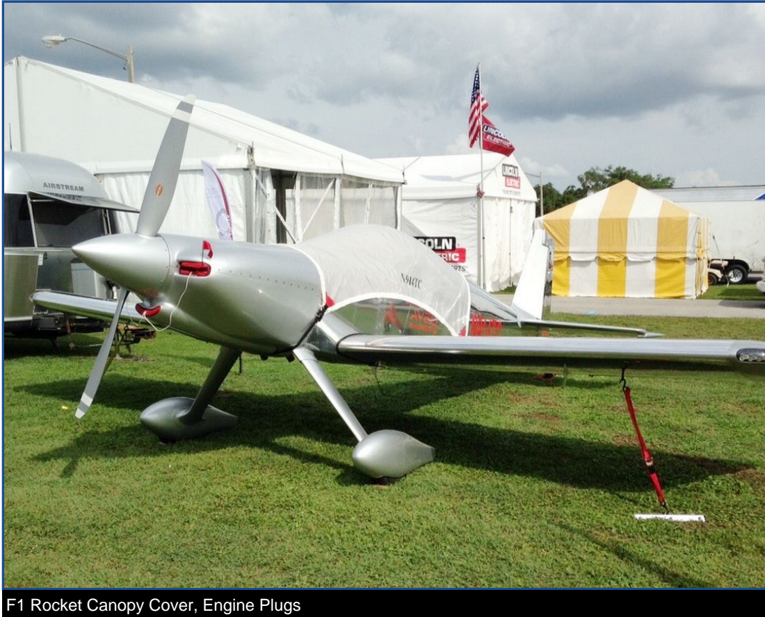
F1 Rocket Canopy Cover, Engine Plugs