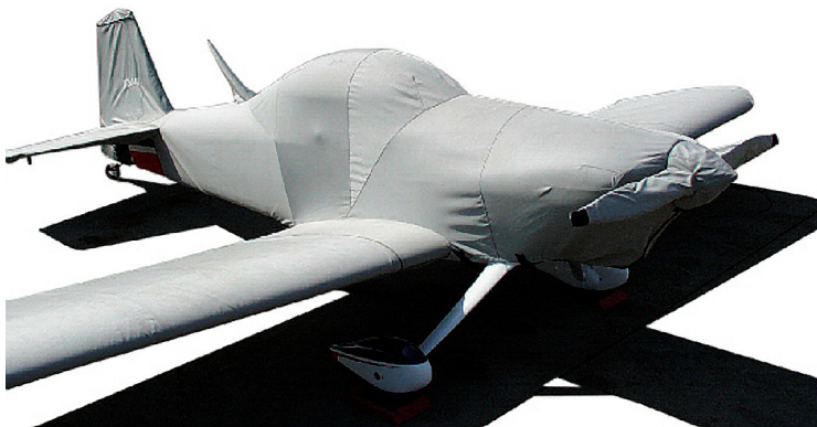
Van's RV-4 Complete Cover

This cover type is made from Silver Acrylic Sunbrella canvas and is 100% lined with a soft and smooth microfiber. Bruce's Custom Covers developed this material combination especially for aircraft protection. The outer material is medium weight and treated for water resistance, UV resistance and anti-static buildup. The inner lining is a very soft and smooth microfiber to prevent scratching. The material is very reflective, and tests show that the cabin interior temperature can be reduced to near-ambient temperature on the hottest of days. It is water, ice and snow repellent, yet breathable to allow moisture to escape from between the cover and the aircraft surface.