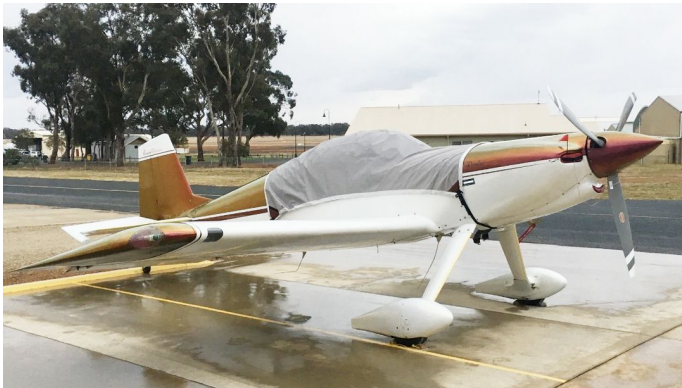
F1 Rocket Travel Cover, Light Weight Travel Canopy Cover, Bubble Windshield, Engine Plugs

Engine Inlet Plugs are custom fit for your Team Rocket F1 Rocket intakes, made with heavy-duty vinyl material, and stuffed with a single block of sculpted urethane foam. Each plug has a zipper that allows the foam to be removed and dried if necessary. Engine plugs have warning flags that are visible from the cockpit or 'remove before flight' streamers sewn onto the face of the plugs. Most plugs are imprinted with the aircraft registration number in black for an extra charge. Storage bag NOT included. Engine plugs may be inserted after flight when the engine is still warm. Engine Inlet Plugs are commonly referred to as Cowl Plugs, Intake Plugs, Cowl Blocks, Engine Blocks, and Engine Bungs.