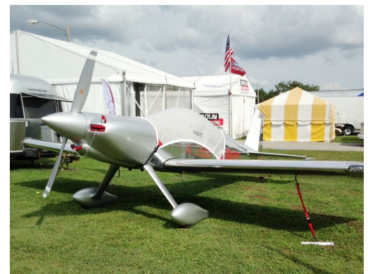
F1 Rocket Canopy Cover, Engine Plugs