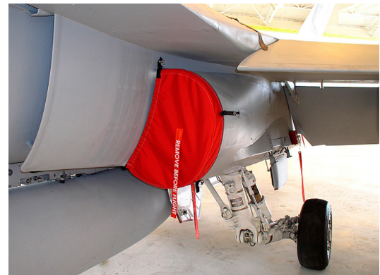
F-18 Engine Inlet Cover