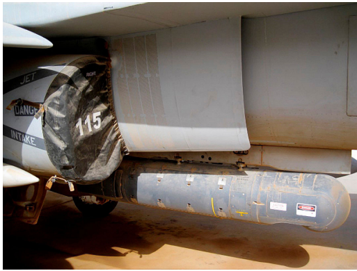
F-18 Intake Covers

The McDonnell Douglas F-18 Hornet, Super Hornet Intake Covers are designed to install easily yet be completely storable. A spring steel hoop is sewn into the hem of each cover, allowing them to be installed without climbing onto the wing or using a step ladder. To store the covers the spring steel hoop folds like a band-saw blade into three nesting rings. Each cover folds into a compact circular bundle which is stored in the included duffle bag, yet they unfold quickly for use. The Tri-Fold Ring cover is made of medium weight nylon which is available in a variety of colors to match the paint trim. Each cover set comes complete with installation and folding instructions. The aircraft's registration number can be silkscreened onto the cover for an extra charge.