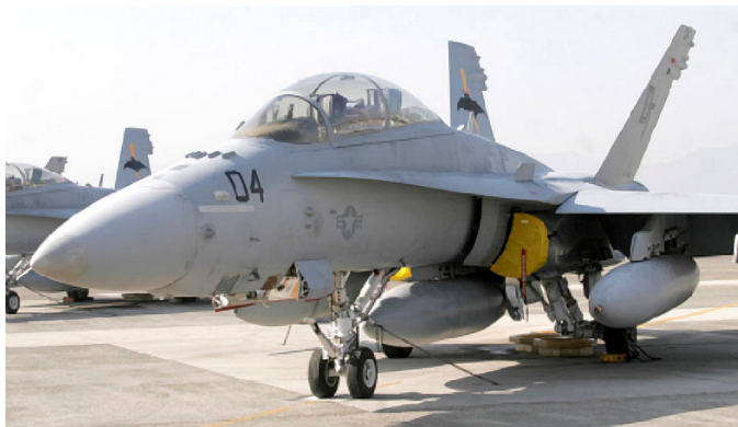
F-18 Intake Cover Set

The McDonnell Douglas F-18 Hornet, Super Hornet Intake Covers are designed to install easily yet be completely storable. A spring steel hoop is sewn into the hem of each cover, allowing them to be installed without climbing onto the wing or using a step ladder. To store the covers the spring steel hoop folds like a band-saw blade into three nesting rings. Each cover folds into a compact circular bundle which is stored in the included duffle bag, yet they unfold quickly for use. The Tri-Fold Ring cover is made of medium weight nylon which is available in a variety of colors to match the paint trim. Each cover set comes complete with installation and folding instructions. The aircraft's registration number can be silkscreened onto the cover for an extra charge.