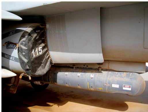
F-18 Intake Covers

The McDonnell Douglas F-18 Hornet, Super Hornet Intake Covers are designed to install easily yet be completely storable. A spring steel hoop is sewn into the hem of each cover, allowing them to be installed without climbing onto the wing or using a stepladder. To store the covers the spring steel hoop folds like a band-saw blade into three nesting rings. Each cover folds into a compact circular bundle which is stored in the included duffle bag, yet they unfold quickly for use. The Tri-Fold Ring cover is made of medium weight nylon which is available in a variety of colors to match the paint trim. Each cover set comes complete with installation and folding instructions. The aircraft's registration number can be silkscreened onto the cover for an extra charge.