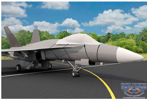
F-18 Canopy Cover, illustration