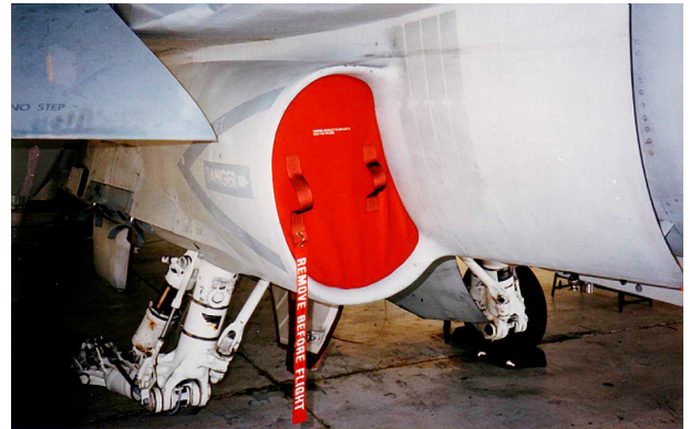
Engine Inlet Plug