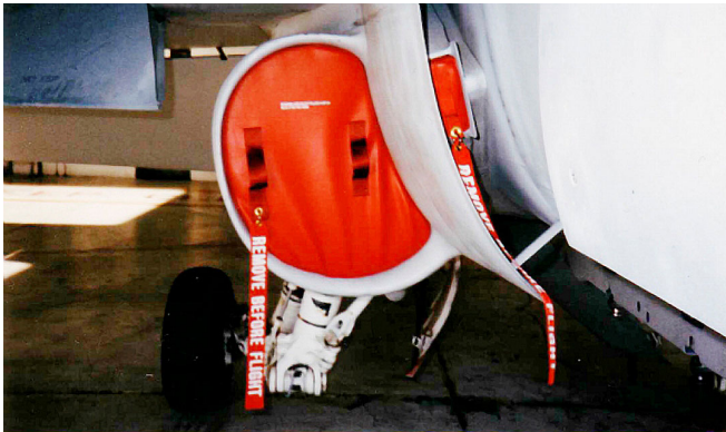
Engine & ECS Inlet Plugs

The Engine Inlet Plugs are custom fit for your McDonnell Douglas F-18 Hornet, Super Hornet intakes, made with heavy-duty vinyl material, and stuffed with a single block of sculpted urethane foam. Each plug has a zipper that allows the foam to be removed and dried if necessary. Engine plugs have 'remove before flight' streamers sewn onto the face of the plugs. Most plugs are imprinted with the aircraft registration number in black for an extra charge. Storage bag NOT included. Engine plugs may be inserted after flight when the engine is still warm. Engine Inlet Plugs are commonly referred to as Cowl Plugs, Intake Plugs, Cowl Blocks, Engine Blocks, and Engine Bungs.