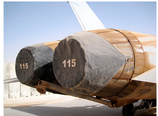
F-18 Exhaust Covers