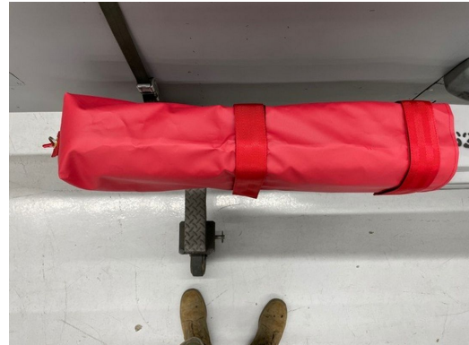
McDonnell Douglas F-15 Launcher Rail Cover