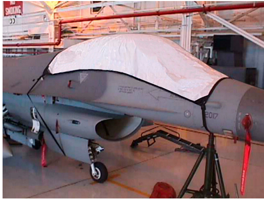
F-16 "Blackout" type Canopy Cover

Canopy Covers are commonly referred to as Cabin Covers, Fuselage Covers, Canvas Covers, Canopy Caps, etc.