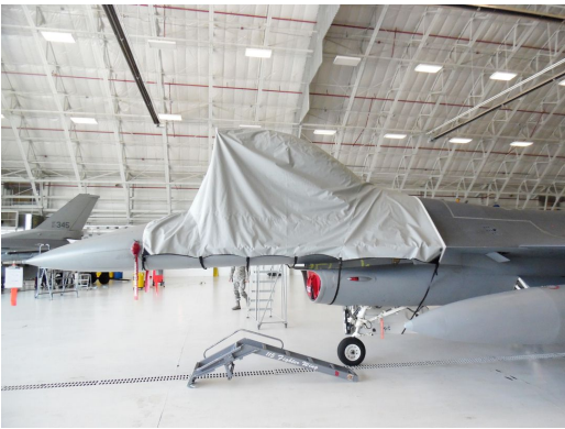
F-16 CANOPY COVER, OPEN POSITION (C-Model, single seat models)