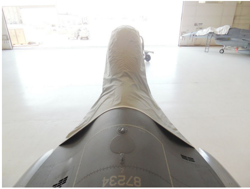
F-16 CANOPY COVER, OPEN POSITION (C-Model, single seat models)

Canopy Covers are commonly referred to as Cabin Covers, Fuselage Covers, Canvas Covers, Canopy Caps, etc.