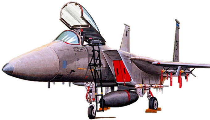
F15 Cockpit HeatShields & Intake Plugs

The Engine Inlet Plugs are custom fit for your McDonnell Douglas F-15 Eagle intakes, made with heavy-duty vinyl material, and stuffed with a single block of sculpted urethane foam. Each plug has a zipper that allows the foam to be removed and dried if necessary. Engine plugs have 'remove before flight' streamers sewn onto the face of the plugs. Most plugs are imprinted with the aircraft registration number in black for an extra charge. Storage bag NOT included. Engine plugs may be inserted after flight when the engine is still warm. Engine Inlet Plugs are commonly referred to as Cowl Plugs, Intake Plugs, Cowl Blocks, Engine Blocks, and Engine Bung.