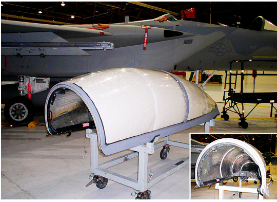
F-15 Cockpit HeatShield