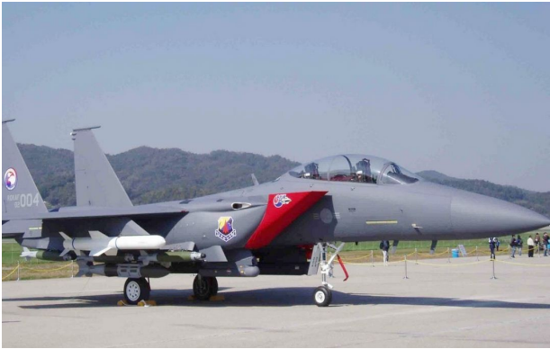
McDonnell Douglas F-15 Eagle Engine Inlet Covers