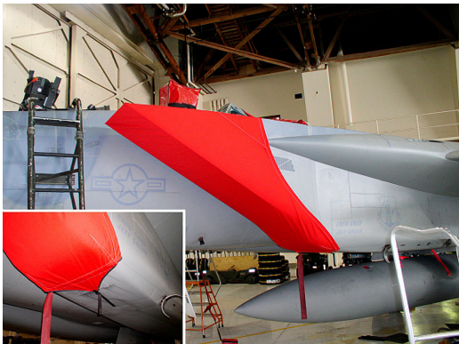
Intake Cover, Attachment Detail (inset)

The McDonnell Douglas F-15 Eagle Intake Covers are designed to install easily yet be completely storable. A spring steel hoop is sewn into the hem of each cover, allowing them to be installed without climbing onto the wing or using a stepladder. To store the covers the spring steel hoop folds like a band-saw blade into three nesting rings. Each cover folds into a compact circular bundle which is stored in the included duffel bag, yet they unfold quickly for use. The Tri-Fold Ring cover is made of medium weight nylon which is available in a variety of colors to match the paint trim. Each cover set comes complete with installation and folding instructions. The aircraft's registration number can be silkscreened onto the cover for an extra charge.