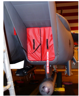
F15 Intake Plugs