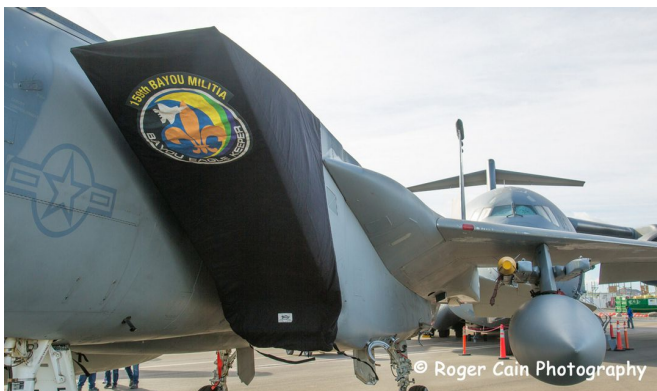
McDonnell-Douglas F-15 Intake Covers

The McDonnell Douglas F-15 Eagle Intake Covers are designed to install easily yet be completely storable. A spring steel hoop is sewn into the hem of each cover, allowing them to be installed without climbing onto the wing or using a stepladder. To store the covers the spring steel hoop folds like a band-saw blade into three nesting rings. Each cover folds into a compact circular bundle which is stored in the included duffle bag, yet they unfold quickly for use. The Tri-Fold Ring cover is made of medium weight nylon which is available in a variety of colors to match the paint trim. Each cover set comes complete with installation and folding instructions. The aircraft's registration number can be silkscreened onto the cover for an extra charge.