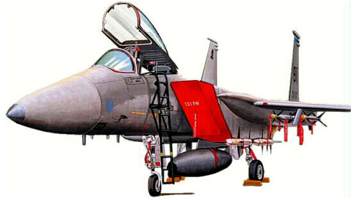
F15 Cockpit HeatShields & Inlet Cover