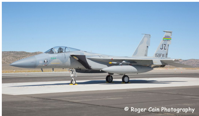
McDonnell-Douglas F-15 Intake Covers

The McDonnell Douglas F-15 Eagle Intake Covers are designed to install easily yet be completely storable. A spring steel hoop is sewn into the hem of each cover, allowing them to be installed without climbing onto the wing or using a stepladder. To store the covers the spring steel hoop folds like a band-saw blade into three nesting rings. Each cover folds into a compact circular bundle which is stored in the included duffle bag, yet they unfold quickly for use. The Tri-Fold Ring cover is made of medium weight nylon which is available in a variety of colors to match the paint trim. Each cover set comes complete with installation and folding instructions. The aircraft's registration number can be silkscreened onto the cover for an extra charge.