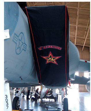
F15 Intake Cover