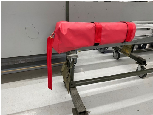
McDonnell Douglas F-15 Launcher Rail Cover

ALL-YEAR USE MATERIAL - Made with Silver Acrylic Sunbrella canvas, the all-year use material is the best option for sun protection and cover longevity. This heavier more durable material is intended for all weather conditions, such as rain and snow or lots of sun.