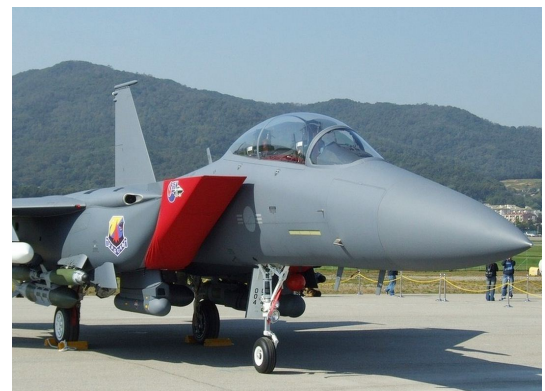
McDonnell Douglas F-15 Eagle Engine Inlet Covers