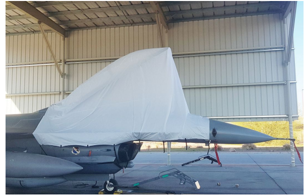
McDonnell Douglas F16-D Canopy Cover, open cockpit type (test fit cover)