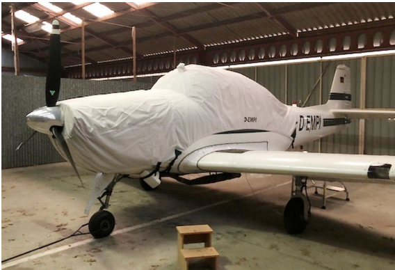
Piaggio FW-149D Canopy/Engine Cover