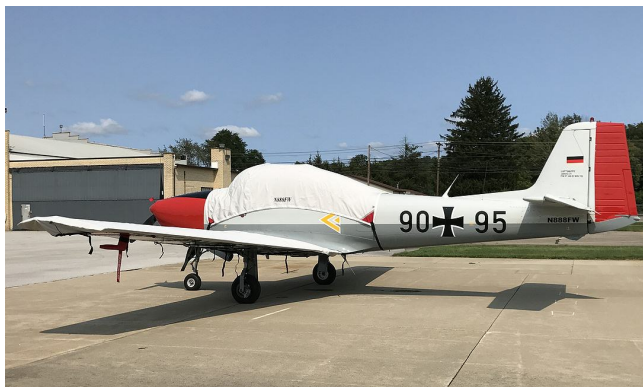
Focke Wulf F149 Canopy Cover, Wing Covers

WINTER USE MATERIAL - Made with Solution-Dyed Polyester fabric, this option is intended for seasonal use to aid in deicing, rain mitigation, or for occasional travel. The material is lighter and more compact, but more susceptible to UV damage and may have a shorter useful life if used continuously outside than the all-year use material.