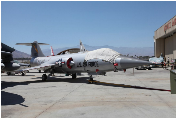
Lockheed F104 Canopy Cover, Intake Plugs