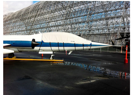
F-104 Tandem Canopy Cover