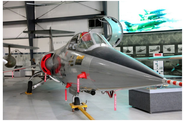
Lockheed F-104 Starfighter Intake Plugs