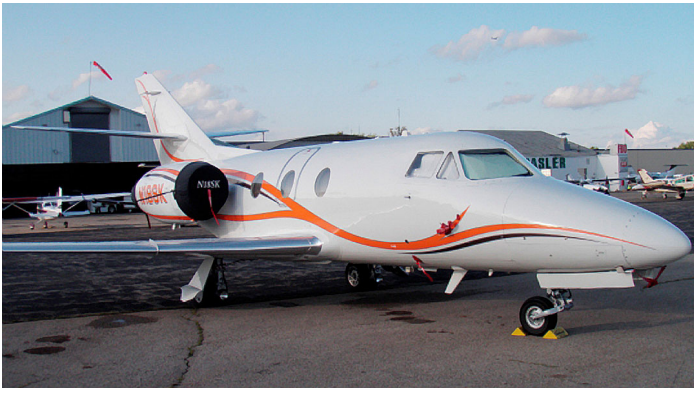
Falcon Jet Engine Intake/Exhaust Cover Set