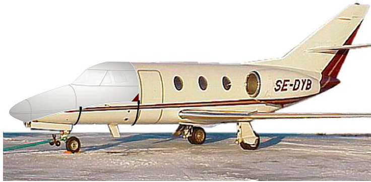
Cockpit/Nose Cover (Illustration)