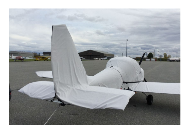
Evektor Sportstar Full Cover Set