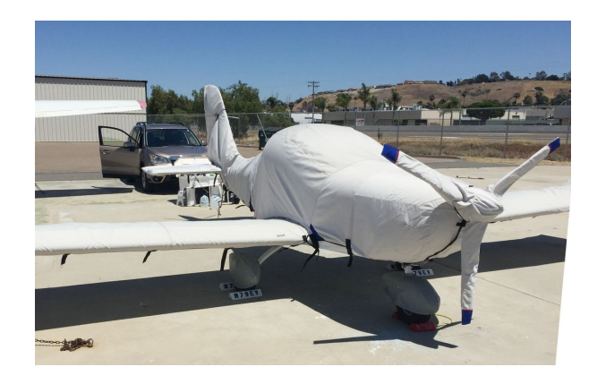
2017 Evector Sportstar Max Extended Canopy/Engine Cover

This cover type is made from Silver Acrylic Sunbrella canvas and is 100% lined with a soft and smooth microfiber. Bruce's Custom Covers developed this material combination especially for aircraft protection. The outer material is medium weight and treated for water resistance, UV resistance and anti-static buildup. The inner lining is a very soft and smooth microfiber to prevent scratching. The material is very reflective, and tests show that the cabin interior temperature can be reduced to near-ambient temperature on the hottest of days. It is water, ice and snow repellent, yet breathable to allow moisture to escape from between the cover and the aircraft surface.