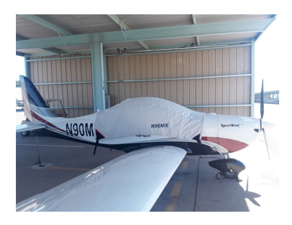
Evektor Sportstar Max Canopy Cover