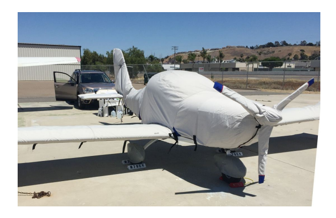
2017 Evector Sportstar Max Extended Canopy/Engine Cover

shorter useful life if used continuously outside than the all-year use material.