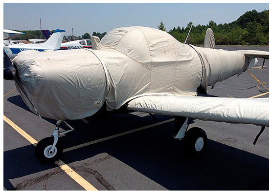
Ercoupe full cover set: Extended Canopy, Engine, Wing & Empennage covers