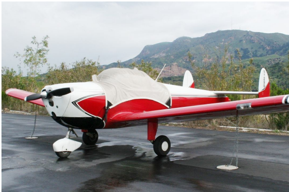
Ercoupe Canopy Cover