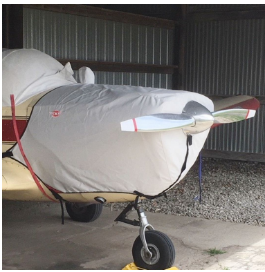
Ercoupe Engine Cover