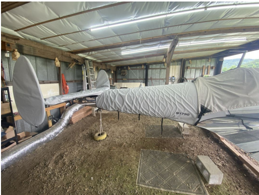
Ercoupe Empennage Cover