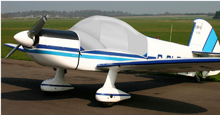
Mudry CAP 10 Canopy Cover (Illustration)

Travel Covers are made with Silver Solution-Dyed Polyester fabric and only lined over the windshield to save weight. The material is lightweight and more compact for easy stowage in the aircraft. The polyester material is water resistant, but only intended for occasional use outside. We also have an ultra lightweight material available for fitted hangar dust covers. For daily outdoor use, the non-travel Sunbrella Cover is the best choice.