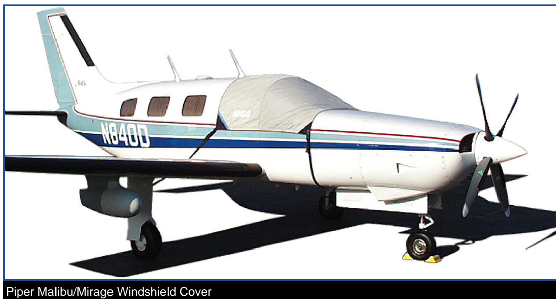
Piper Malibu/Mirage Windshield Cover