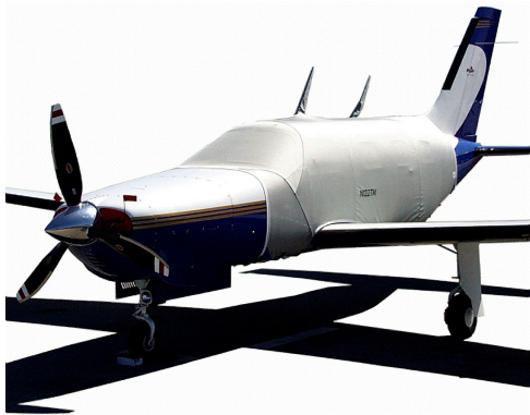
Piper Malibu/Mirage/Meridian Extended Canopy Cover