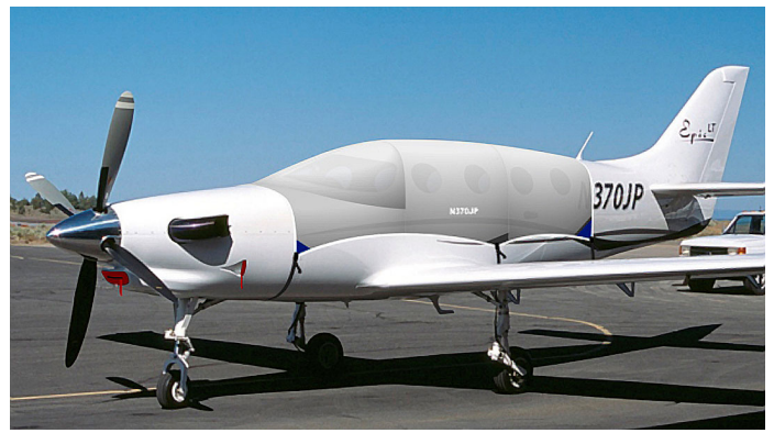
Epic LT Canopy Cover & Engine Plugs