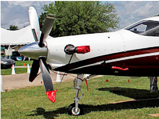
Epic Prop Tie-down/Exhaust cover set

This cover type is made from Silver Acrylic Sunbrella canvas and is 100% lined with a soft and smooth microfiber. Bruce's Custom Covers developed this material combination especially for aircraft protection. The outer material is medium weight and treated for water resistance, UV resistance and anti-static buildup. The inner lining is a very soft and smooth microfiber to prevent scratching. The material is very reflective, and tests show that the cabin interior temperature can be reduced to near-ambient temperature on the hottest of days. It is water, ice and snow repellent, yet breathable to allow moisture to escape from between the cover and the aircraft surface.