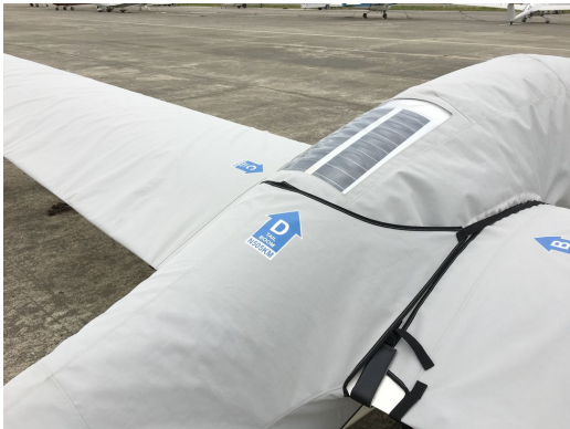
DG-505 Full Cover Set